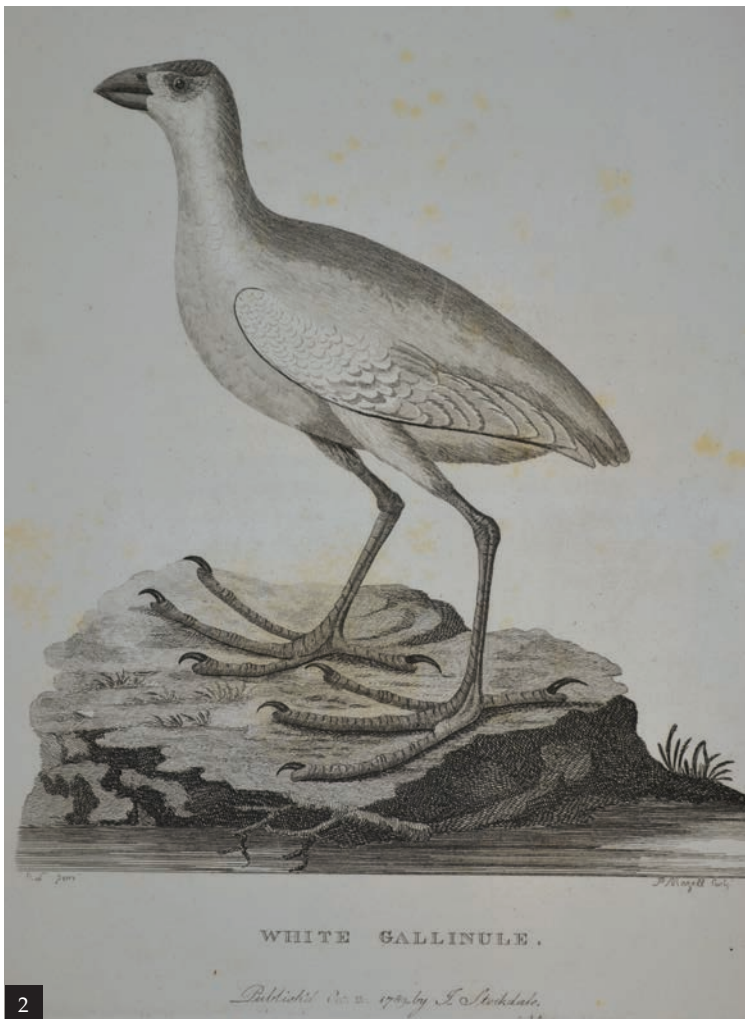
Figure 2. White Gallinule, pl. 44 in Phillip (1789), probably based on a live specimen (Hein van Grouw, Natural History Museum, Tring)