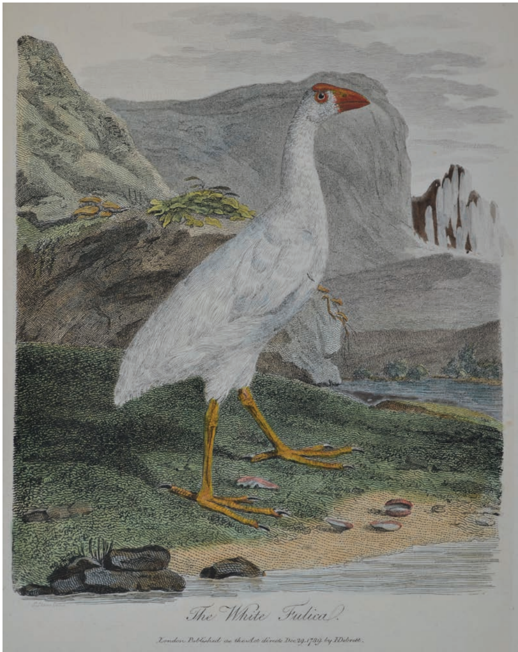
Figure 6. The White Fulica, pl. 27 in White (1790), as depicted by Sarah Stone based on the mounted specimen in the Leverian Museum (Hein van Grouw, Natural History Museum, Tring)