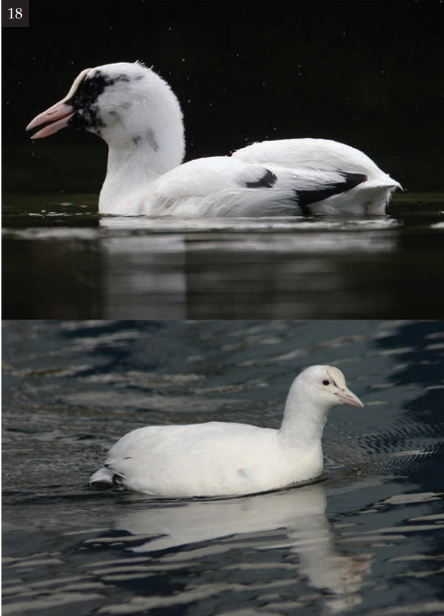
Figure 18. Two Common Coots Fulica atra showing different stages of progressive greying; top: Tolkamer, the Netherlands, 29 June 2006, below (in final stage of progressive Greying): Capelle aan den IJssel, the Netherlands, 28 March 2004