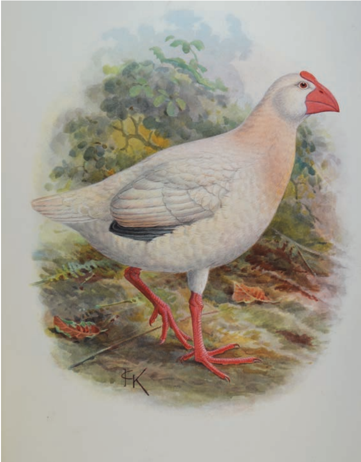
Figure 13. Illustration of a Takaha-like Lord Howe Gallinule Notornis alba in Rothschild (1907) by J. G. Keulemans, based on how Rothschild thought the species would have appeared in life; although it is based on the Vienna specimen, artistic license permitted Rothschild / Keulemans to erroneously picture the bird with coloured primaries

raperi in recognition of the artist. His grounds were extremely dubious to say the least and, subsequently, when Mathews (1936) had reproduced the Raper painting (Fig. 14) and compared it to the Vienna skin, he admitted his error and synonymised P. raperi under P. albus .