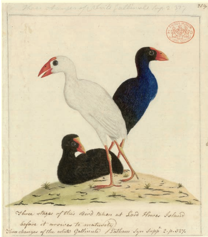
Figure 8. Illustration by an anonymous artist of three Lord Howe Gallinules Porphyrio albus from Thomas Watling's collection, NHMUK-L-Watling-330-M-1; the handwritten note reads 'Three stages of this Bird, taken at Lord Howes Island, before it arrives at maturity (Natural History Museum, London)

gallinule (cf. Iredale 1910, Hindwood 1932). Despite this lack of first-hand evidence, several commentators confused the provenance, even leading to the description of supposed Norfolk Island birds as a second species of white gallinule.