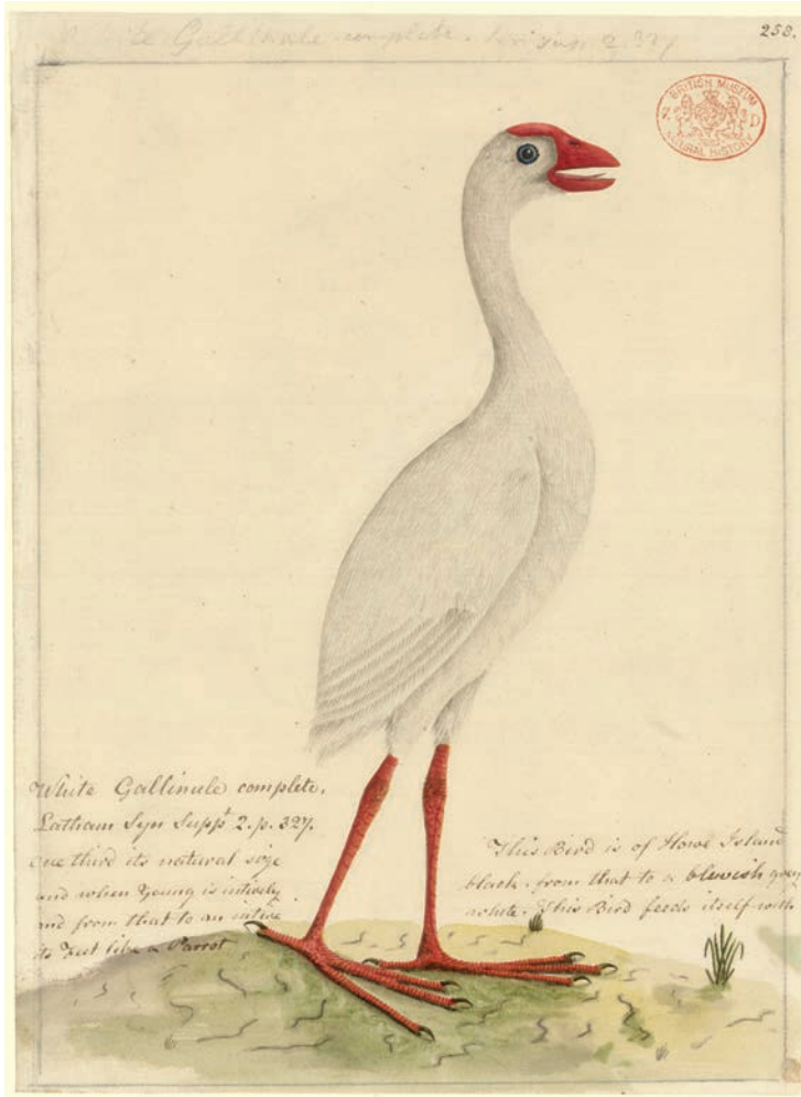
Figure 7. Illustration by an anonymous artist of a Lord Howe Gallinule Porphyrio albus from Thomas Watling's collection, NHMUK-L-Watling-329-M-1; the handwritten notes read 'This bird is of Lord Howe and when young is entirely [sic] black, from that to a bluish grey and from that to an entire [sic] white. The bird feeds itself with its feet like a parrot' (Natural History Museum, London)

He made an ornithological report, the first survey of the avifauna of Lord Howe Island for 63 years, but did not mention the gallinule (Foulis 1853, Hindwood 1940). No doubt a poorly volant, chicken-sized gallinule quickly fell prey to whalers and sealers, and disappeared extremely rapidly, possibly even by the end of the 18th century. And, although Bassett-Hull (1909) hoped for its rediscovery, the confirmed existence of the Lord Howe Gallinule spanned just two years.