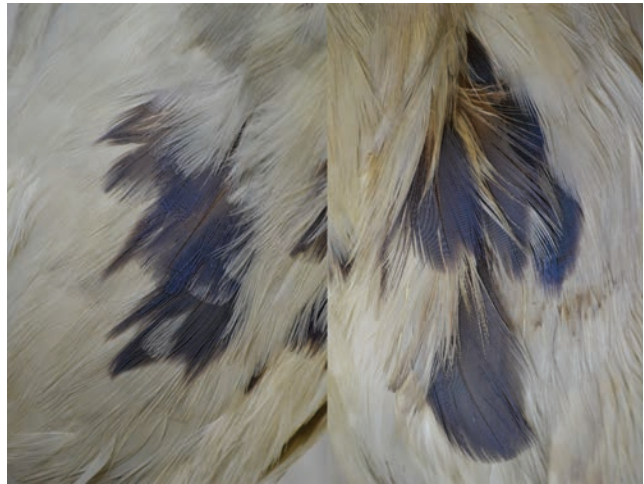
Figure 20. ‘Shoulders’ (left and right side) of Liverpool specimen of Lord Howe Gallinule Porphyrio albus (WML D3213) showing a few remnant purple-blue feathers, a colour not found in the shoulder/upperparts plumage of any subspecies of Purple Swamphen P. porphyrio (Hein van Grouw)

The most striking difference between P. albus and other Porphyrio , except P. p. melanotus , is the short middle toe, which is especially reduced in the Liverpool specimen. In all other P. porphyrio subspecies, the middle toe is the same length or even slightly longer than the tarsus, but in P. p. melanotus , however, the middle toe is shorter than the tarsus, just as in P. albus . The tail of the Vienna