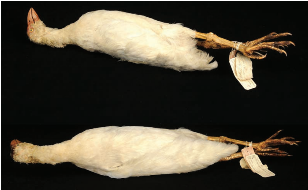
Figure 12. Lateral (top) and dorsal views of the specimen at the Naturhistorisches Museum Wien (NMW 50761), probably collected March 1788 on Lord Howe Island, the type specimen of Porphyrio alba (White, 1790)

by Keulemans, is identical in pose to the Liverpool mount. So either Forbes was in error, or the specimen has been remade (again) since Forbes, based on the plate in Rowley. Sarah Stone's illustration of the Vienna bird was probably derived from the original pose of the mounted specimen, rather than the specimen being modelled on her painting; the skin is now demounted with legs outstretched (Fig. 12).