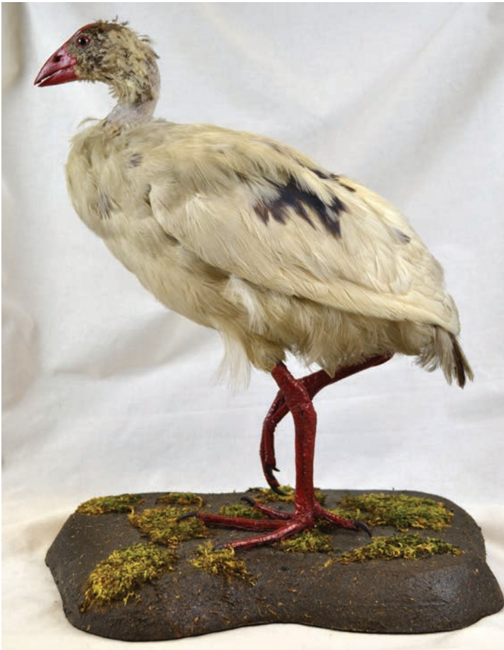
Figure 11. Liverpool specimen of Porphyrio albus (WML D3213), probably collected March or May 1788 on Lord Howe Island, and the type of Porphyrio stanleyi Rowley, 1875, which was probably re-prepared (modelled) after Keuleman's illustration (see Fig. 9) (Hein van Grouw)

with Pelzeln (1860) that Lord Howe Gallinule was more similar to New Zealand Takahe Notornis mantelli and therefore should be placed in Notornis , as shown in the accompanying illustration by J. G. Keulemans (Fig. 10). However, Salvin apparently never saw the Vienna specimen and based his attribution purely on a drawing of it provided to him by Pelzeln, stating: 'I therefore (depending, of course, upon the accuracy of the drawing sent me, which has been placed on stone by Mr. Keulemans on a slightly larger scale than the original sketch) have little hesitation in adding this species to the genus Notornis , thereby confirming the position pointed out for it by Herr von Pelzeln...'. Salvin's caution seems justified as, in our opinion, Pelzeln must have been biased towards Takahe when he provided the sketch.