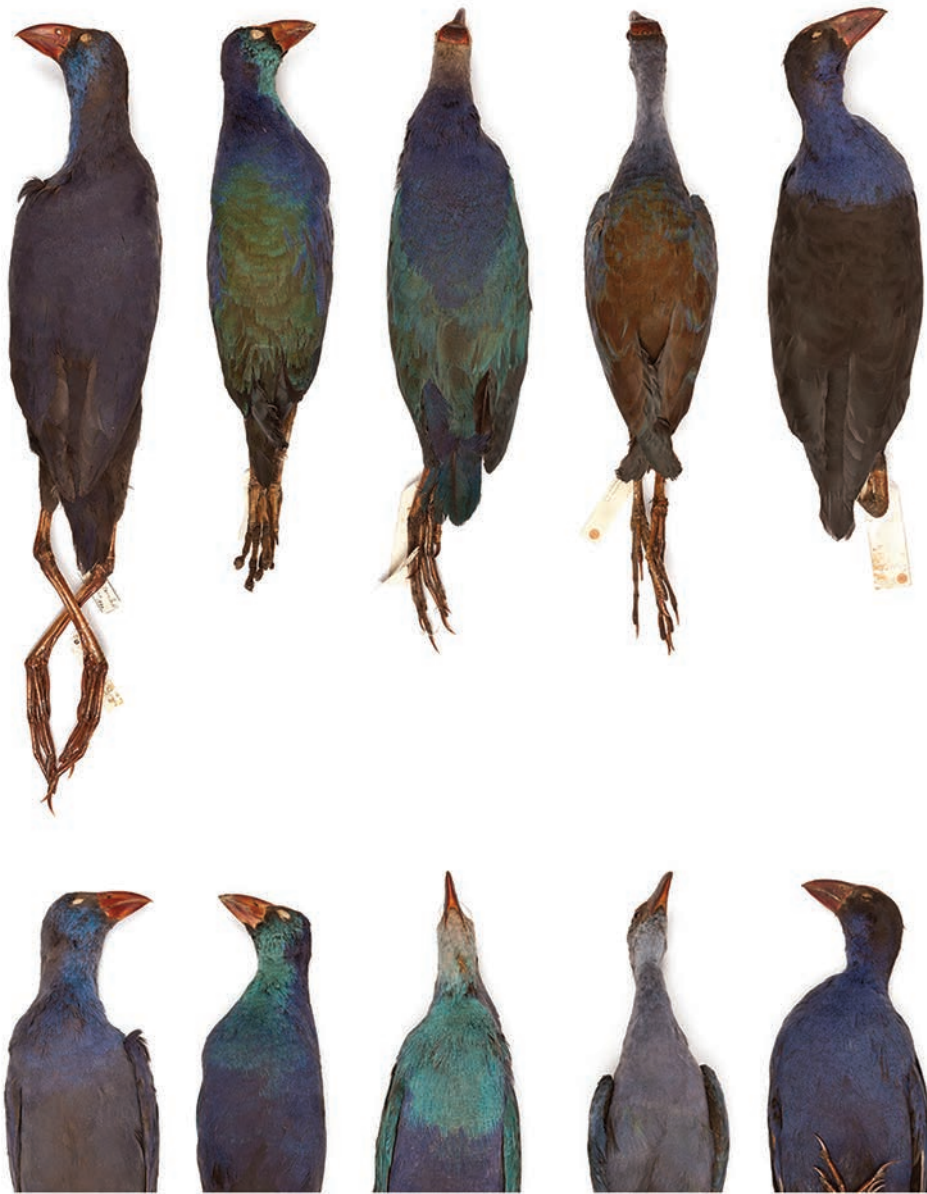
Figure 22. Coloration of different subspecies of Purple Swamphen Porphyrio porphyrio, dorsal (above), ventral (below), from left to right: P. p. porphyrio (NHMUK 1905.6.28.1010), P. p. madagascariensis (NHMUK 1955.6.N.17.38), P. p. poliocephalus (NHMUK 1881.12.29.31), P. p. pulverulentus (NHMUK 1842.2.15.140) and P. p. melanotus (NHMUK 1887.5.2.66)