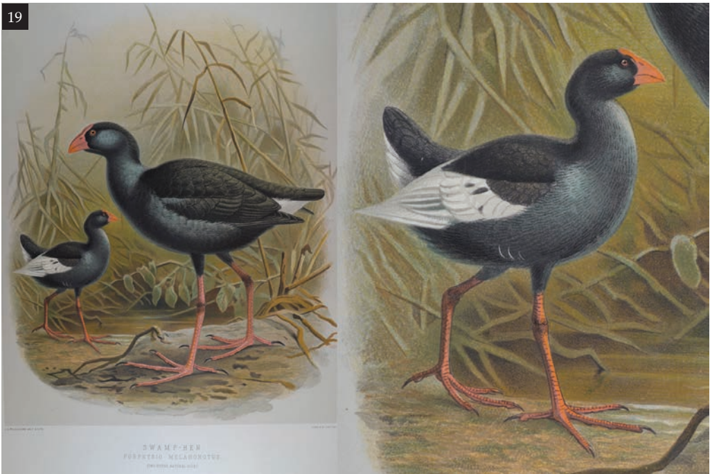
Figure 19. Pl. 31 in Buller (1888); full image (left) and inset (right) of New Zealand Swamphen P. p. melanotus with progressive greying based on a specimen in Buller's collection (Hein van Grouw, Natural History Museum, Tring)