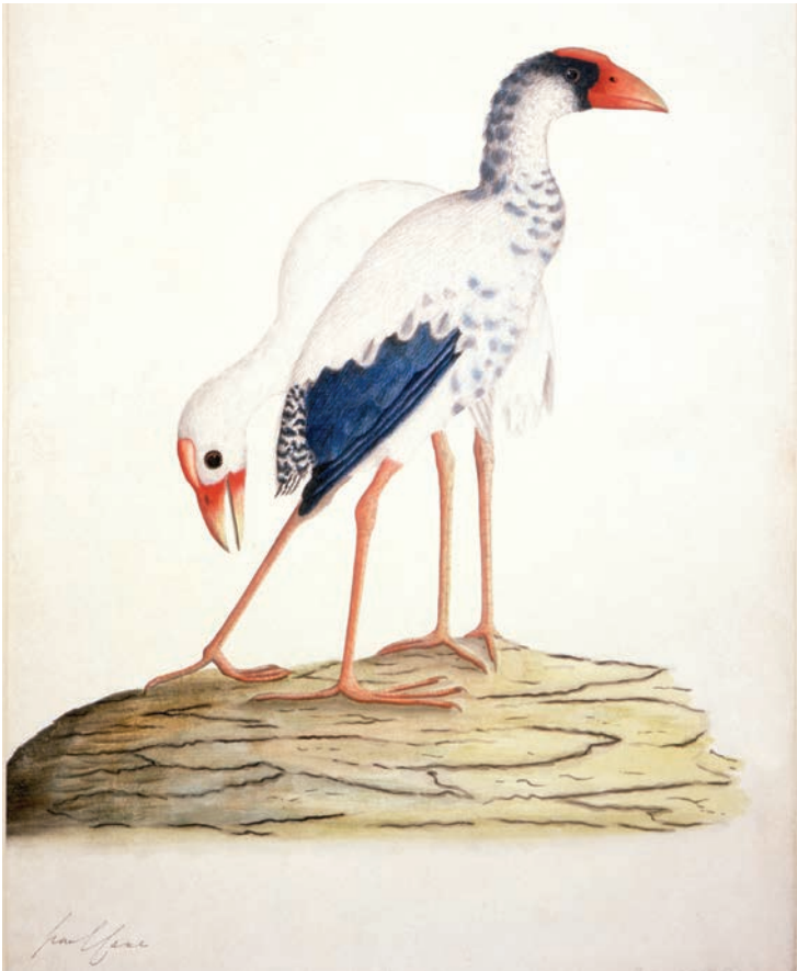
Figure 5. Illustration of two Lord Howe Gallinules Porphyrio albus , one all white and one still variegated, by George Raper (1790); this painting is particularly important as it clearly shows two stages of the colour aberration progressive greying

are furnished with a small crooked spine. In the dried specimen the legs and feet are yellow; but, perhaps, in the living bird might have been of the same colour with the beak.'