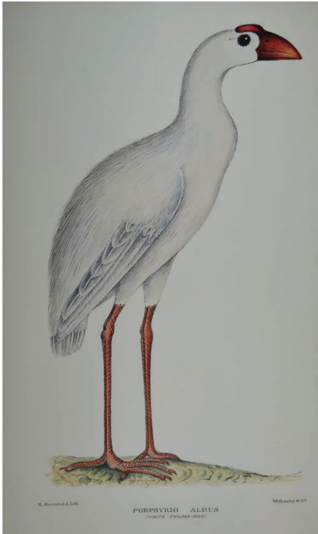
Figure 14. Reconstruction of Raper's painting 1790 in Mathews (1936) (Hein van Grouw, Natural History Museum, Tring)

since 1987 (Ripley 1977, Hutton 1990). Also on Norfolk Island, the species is probably self-introduced and has been recorded since the earliest European occupation (Christian 2005). In early 1900 it was not uncommon and recorded as breeding (Bassett-Hull 1909), but since the 1990s the number of breeding birds has increased dramatically (Christian 2005).