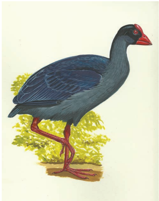
Figure 21. Reconstruction of a blue-coloured (i.e. younger) Lord Howe Gallinule Porphyrio albus , before it becomes white (Julian P. Hume)