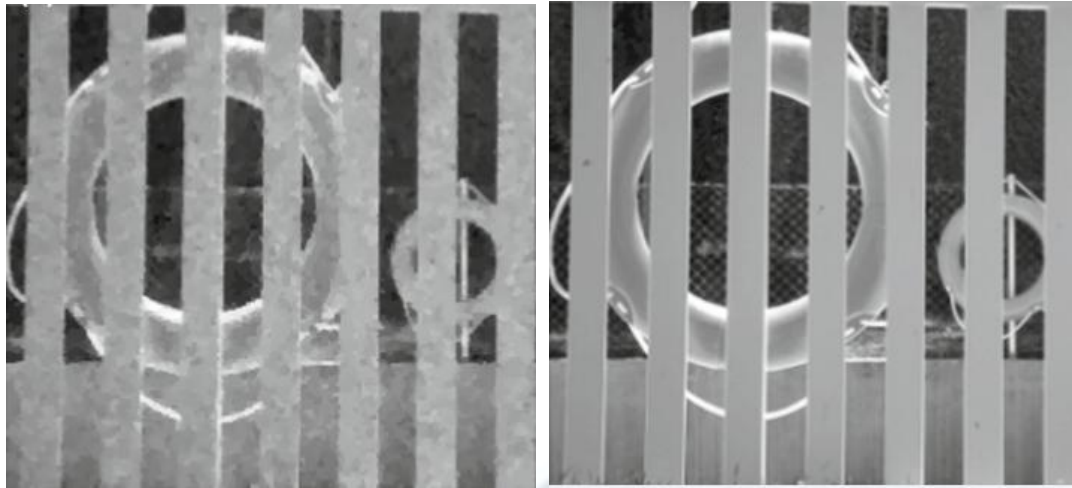
(c) Image denoising by curvelet transform