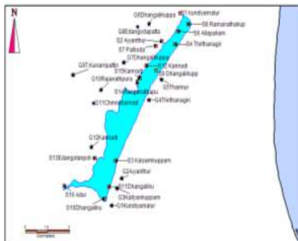
Fig. 1. Location Map of the study area

The Cuddalore district lies in the zone of tropical climate. The climate in the eastern part of the district is influenced by the adjoining Bay of Bengal. The India Meteorological Department (IMD) and the Groundwater Department of Public Works Department, Government of Tamil Nadu have established meteorological station at Cuddalore (N 11° 46', E 79° 46') in the east and at Lekkur (N11° 27', E79°).