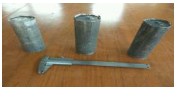
Figure 2 Casting samples

All process parameters were fixed at three levels within the above bounds to conduct experiments based on the L9(3)4 orthogonal array. The details of all parameters and their levels are given in Table 2. For each experimental condition, the casting samples were cast and are shown in Figure 2.