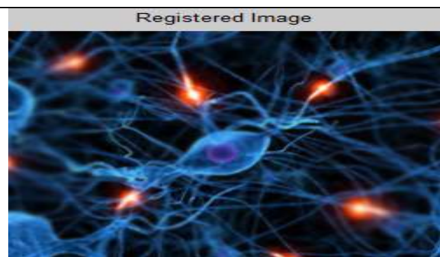
Fig 5 Registered images