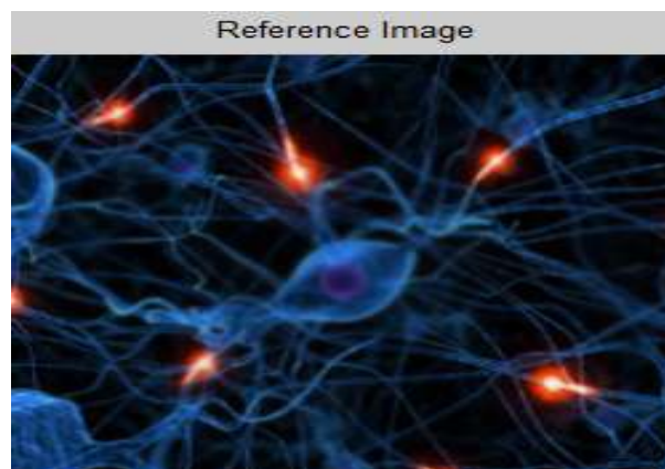
Fig 3 Reference image