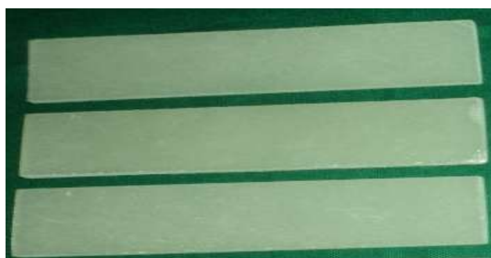
Fig.1. Flexural GFRP composite Coupons.

GFRP composite laminate is fabricated by hand-lay-up using a E-glass woven glass fiber of average thickness 0.28mm. The laminate plate is fabricated by hand-lay-up method with seven layers using LY556 epoxy and hardener HY951 of dimensions 80x200x2.3mm. The laminate is then compressed in a compression molding machine with a compression pressure of 30kg/cm 2 in order to remove the excess resin from the laminate. The laminate is cured for a period of 24 hour. Eight flexural coupons are cut from the lamina laminate of dimension 80x25x2.3mm as per ASTM D790 [13] using a diamond cutter to avoid any structural degradation. Fig.1 Shows the GFRP flexural coupons.