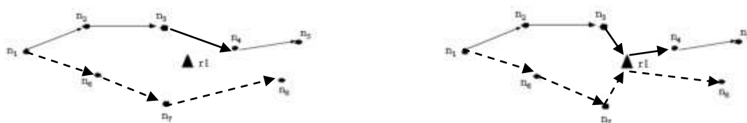
Figure 1. a) Data flows without using a relay node.

where e_i and p_i denotes the residual energy and contextual priority of the source node s_i corresponding to the flow f_i . z_1 and z_2 are the relative weights assigned to the residual energy and contextual priority by the network operator. Min-Total scheme after assigning node weights is given by