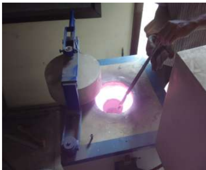
Figure (a) Electric furnace

An open hearth furnace was used for melting and mixing the materials in flat bottom, cylindrical graphite crucible. The fabrication process is conventional mechanical stirring for the distributive mixing of the reinforcement in the matrix. For the work, a new stir caster was developed to fabricate MMC. The mixing equipment for this stage consisted of a driving motor capable of producing a rotation speed within the range of 600rpm, a control part for the vertical movement of the impeller and a transfer tube used for introducing the ceramic powders in the melt.