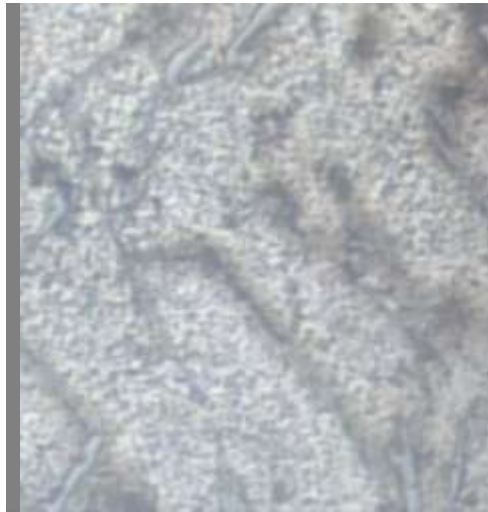
Figure. (e) Microstructure of Al-93% Cr-6% Zr-1% Nano-particles of composite

Microscopic examination extremely used to study and characterization of material and mechanical fracture, and also nano-particles distribution of in the fabricated composites.