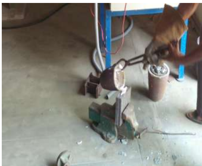
Figure.(b) Pouring metal into the mould cavity

The composite slurry temperature was increased to fully liquid state and automatic stirring was continued to about five minutes at an average stirring speed of 300-350 rpm under protected organ gas. The Cr particles help in distributing the particles uniformly throughout the matrix alloy. The melt was then superheated above liquids temperature and finally poured into the cast iron permanent mould for testing specimen. The size of the fabricated billet composite is 100 mm length and 100 mm width and 10mm thickness.