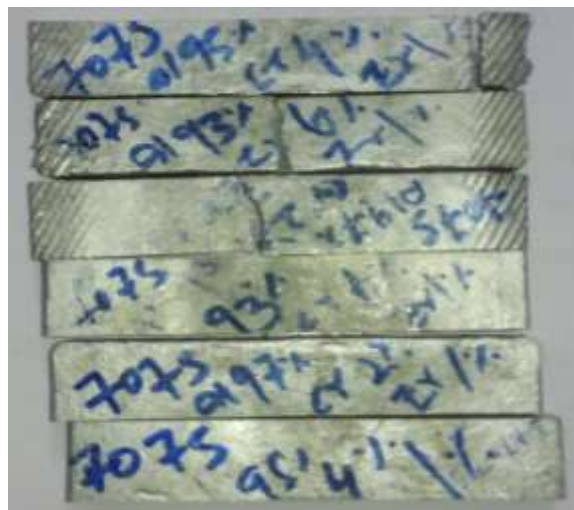
Figure.(f) Fabricated and tested composites.