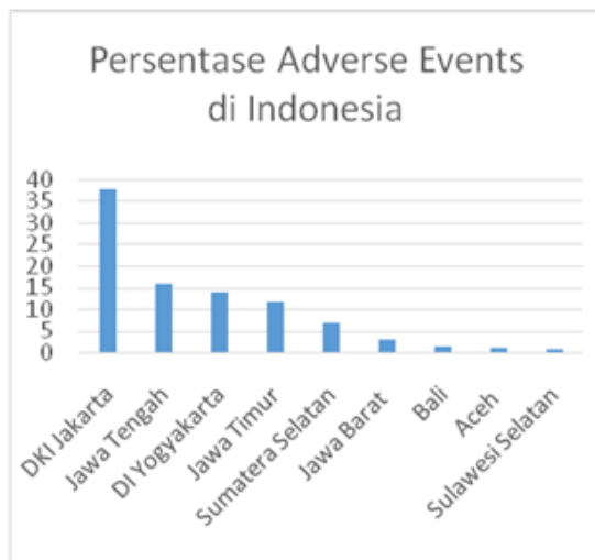
Picture 1. Patient safety incidence report in 2007 based on province.