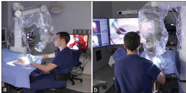
Figure 2: Microsurgical exercises under 2D exoscopic visualization. The position of the operator is shown from the side (a) and from the back (b).

3D: Three-dimensional, * P < 0.05 when compared with operative microscope, † P > 0.05 when compared with operative microscope