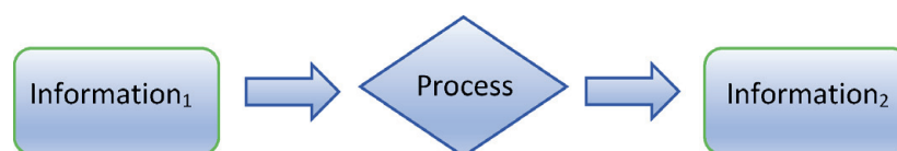
Figure 2. Information in process.

In the context of information in process, take, for example, the process of encrypting text. The input data will be a legible text, such as a sentence, a document, etc., whereas the output generated will be an unintelligible sequence of characters, as is deliberately meant to be by the process. The process itself could be one single operation as simple as circularly shifting characters a certain amount to