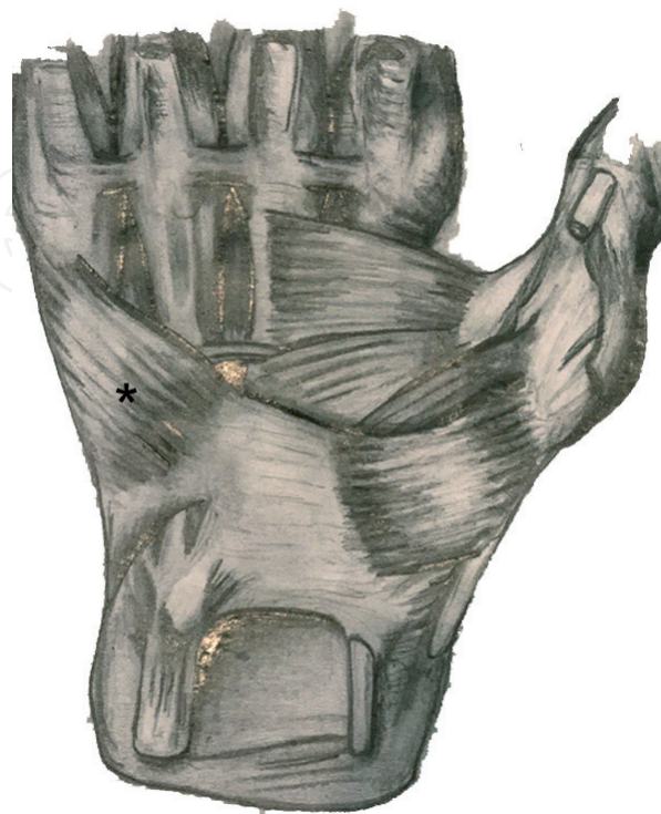
Figure 4. Schematic anterior view of the wrist and hand presenting the ODMm (asterisk).

The ODMm has a triangular form, lying beneath the ADMm and FDMBm. It starts from the hamulus of the hamate bone and near part of the flexor retinaculum and attaches to the ulnar margin and palmar surface of the fifth metacarpal bone ( Figure 4 ) [20, 21].