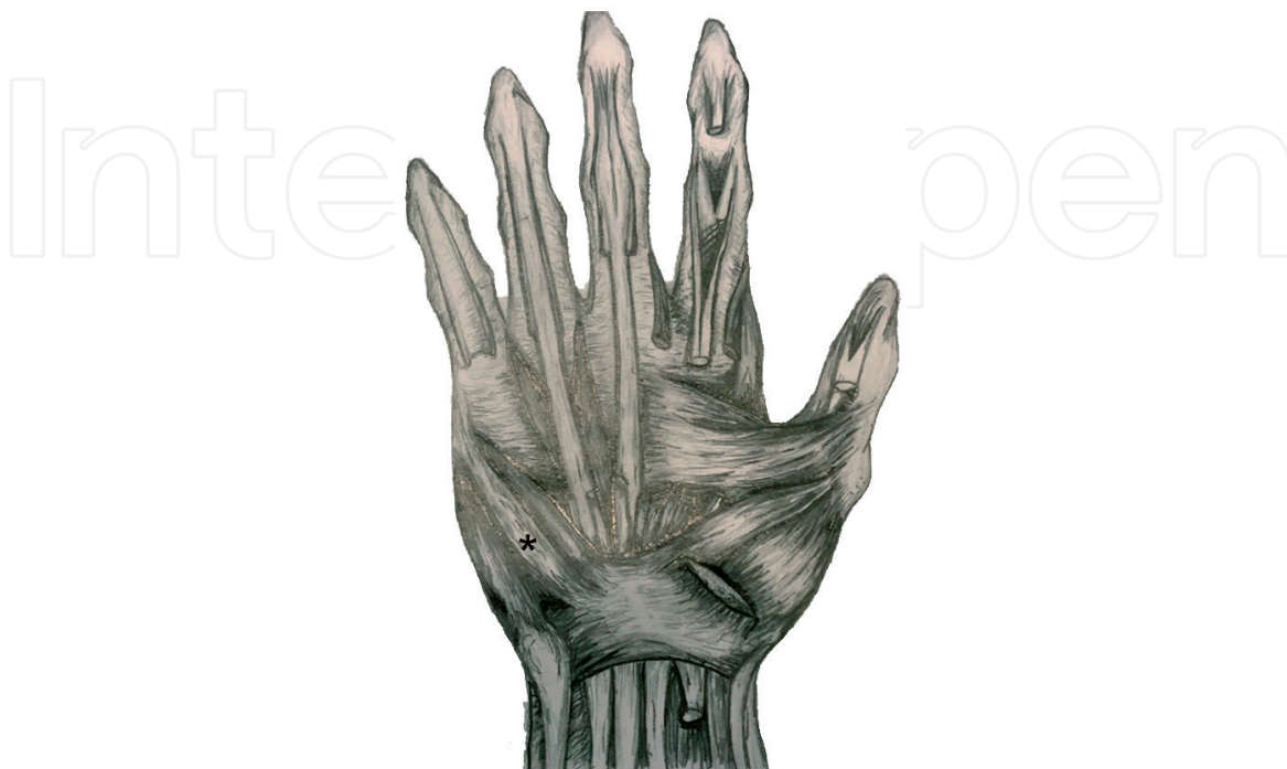
Figure 3. Schematic anterior view of the wrist and hand presenting the FDMBm (asterisk).

The FDMBm is situated more radially than the ADMm. It starts from the hamulus of the hamate bone, and the anterior surface of the flexor retinaculum, and inserts into the ulnar side of the base of the phalanx of the little finger ( Figure 3 ) [20, 21].