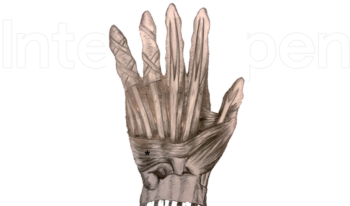
Figure 1. Schematic anterior view of the wrist and hand presenting the Pbm (asterisk).

The variations of the Pbm are rarely reported in the literature. This muscle could vary in size and may be absent or duplicated; it could also insert to flexor digiti minimi brevis muscle or the pisiform bone [25, 26].