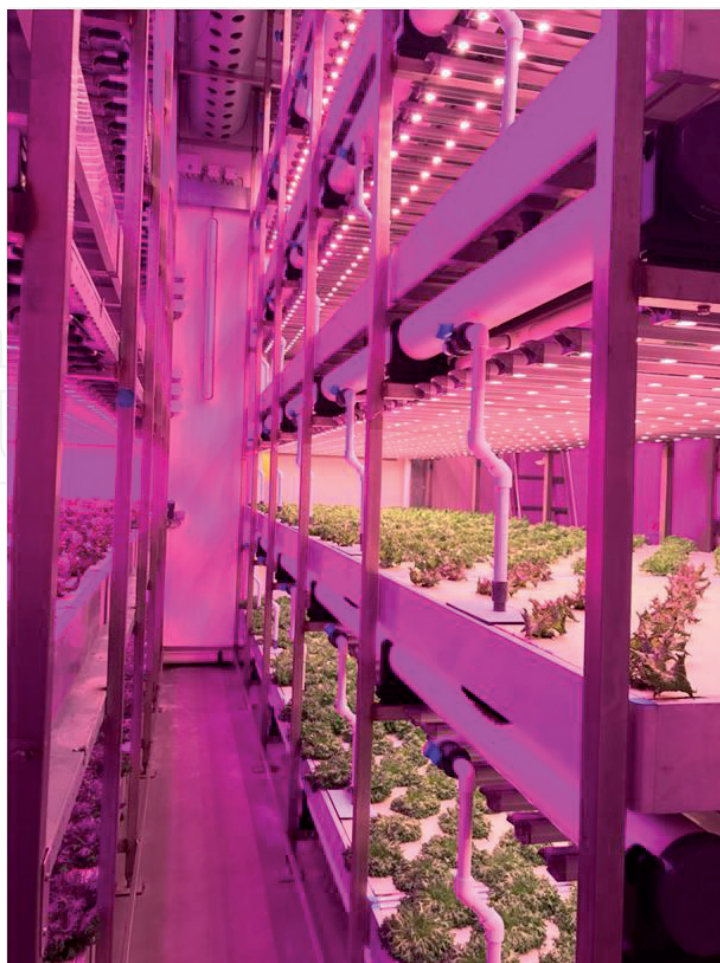
Figure 3. LED lightning in protected area without day light.

in optimizing photosynthesis, photomorphogenesis, and nutrient contents. LEDs make easier monitoring of nitrogen absorption by leafy plants and avoid harmful nitrate concentration in leafy plants and its influence on human health.