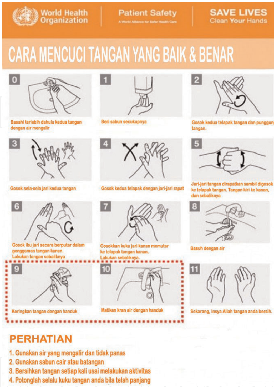
Figure 1. How to wash hands properly and correctly [22].

The National Agency of Drug and Food Control of Republic of Indonesia (NADFC) 2013 exemplifies the composition of balanced nutrition in school children consisting of: