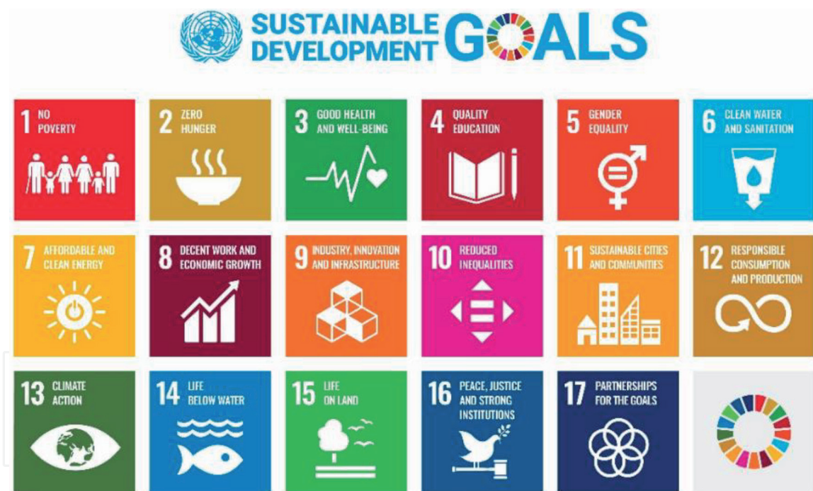
Figure 2. The 17 sustainable development goals [3].

The UN SDGs aim ambitions and necessary targets across a wide range of socio-economic, environmental, and governance issues in order to reduce the significant gaps between high-income countries and emerging economies in terms of population access to critical services (health, education, public utilities, infrastructure) and to limit the extreme poverty among the most vulnerable populations from Asia, Africa, Latin America, or Eastern Europe.