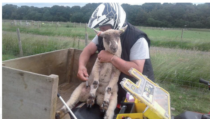
Figure 5. A lamb being treated of infection by an experienced animal health attendant.

albendazole [88], etc. In addition, treatment of bloat disease—gas build up in rumen, requires the service of a veterinary surgeon who might need to insert stomach tube into the rumen to have the built-up gas released and in extreme cases, the rumen will have to be punctured on the left flank with surgical apparatus such as trocar and cannula [16]. This suggests that a farmer cannot handle all treatment of emerging diseases in their farm animals.