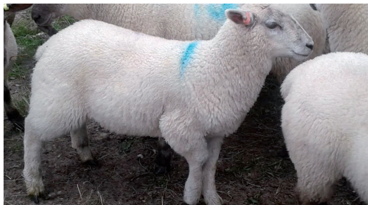
Figure 4. A lamb with lame foot as result of infection.

Hygiene practice is an important aspect of animals' health management and this entails keeping the farm environment free of any anything or condition that could induce pest infestation and disease infections in the animals. This includes