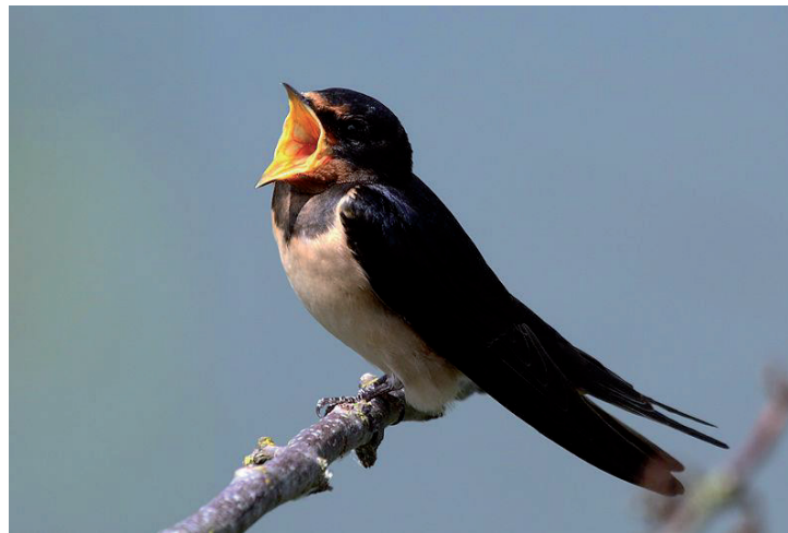
Figure 3. Vocalisation by a bird to its environment for a specific purpose.

some combination of these mediums [60]. These series of signals of animal communication are thus classified into four basic categories, namely visual, auditory, tactile and pheromone cues [60].