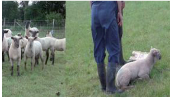
Figure 1. Healthy lambs on their feet with the physiological lamb sitting isolated and unable to move.

by the display of signals that serve as health communication 1 . Common communicative signals by a disease-laden animal could thus take the following forms: