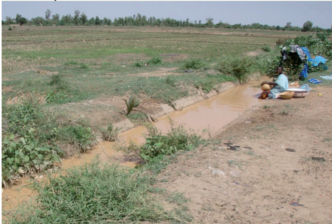
Figure 2. A woman washing dishes in a canal.

of affected women, making them dependent on family members and potentially leading to stigmatization and social exclusion.