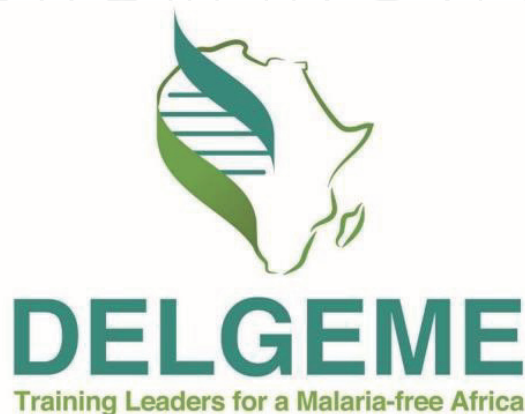
Figure 5. The Developing Excellence in Leadership and Genetics Training for Malaria Elimination in sub-Saharan Africa (DELGEME) program.

Interestingly from last year, genomic education is progressively taking off in Africa. Indeed, many genomic training programs at the countries or regional level are entering in operational phase. Many of them are mainly supported by H3ABioNet which organizes a variety of high quality courses and training events covering various aspects of bioinformatics from general introductory topics to more