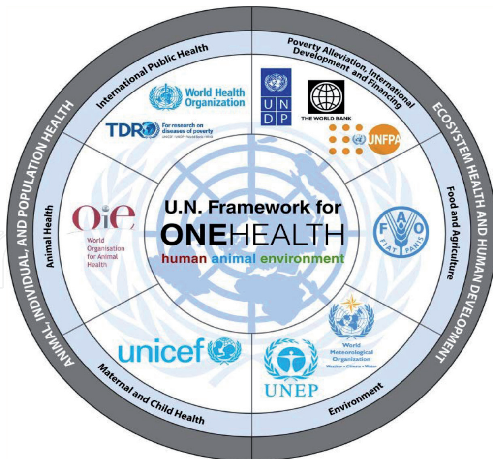
Figure 3. Proposed United Nations "One Health" framework. FAO, Food and Agriculture Organization; OIE, World Organisation for Animal Health; TDR, WHO Special Programme for Research and Training in Tropical Diseases; UNDP, United Nations Development Programme; UNEP, United Nations Environment Programme; UNFPA, United Nations Population Fund; UNICEF, United Nations Children's Fund; WHO, World Health Organization; WMO, World Meteorological Organization.