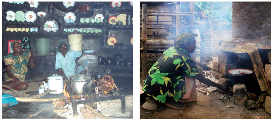
Figure 3. Left: A model CHC kitchen hut in Zimbabwe showing shelving made of clay, individual family utensils and covered drinking water with ladle. Right: In Rwanda, a traditional cooking shelter outside, with no CHC improvements.