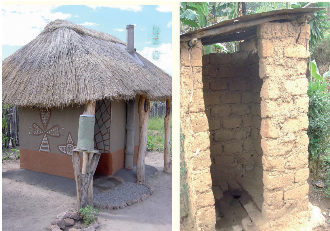
Figure 2. Left: Subsidized ventilated improved pit latrine (VIP) in a CHC home in Zimbabwe with lined pit, concrete slab and vent pipe - a fly trap which eliminates smell and a hand washing facility. Right: An unsubsidized traditional pit latrine in Rwanda, unlined and open pit, log floor giving open access for flies.