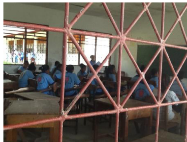
Fig. 2. a classroom in the secondary school 4 de Setembro in Dili.

The aforementioned data was confirmed by trainees during the informal conversations we had with them.