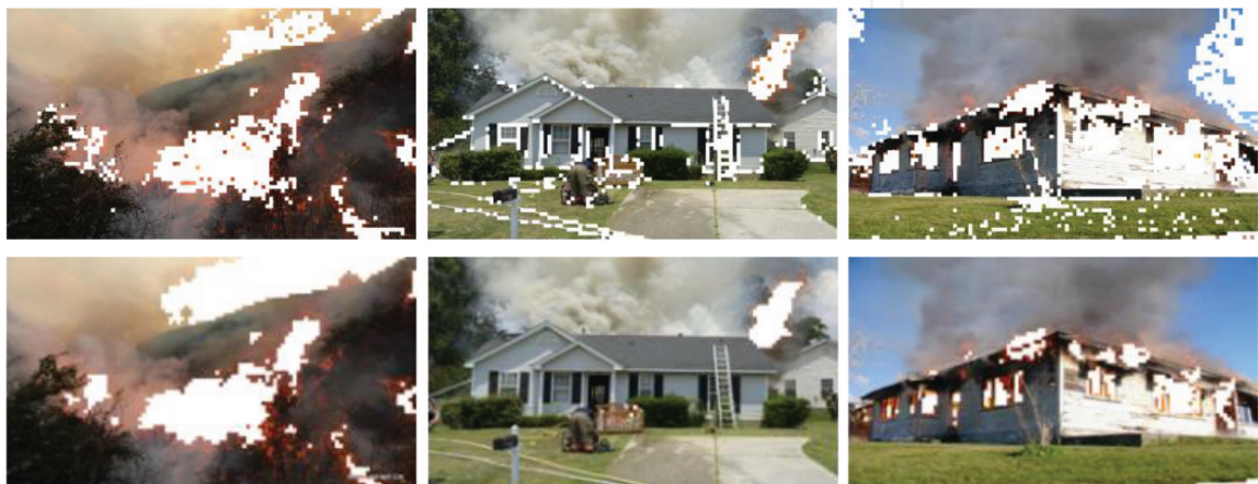
Figure 2. Fire detection using the block-based PCA approach (top row) and block-based SVM approach (bottom row).

Autonomous navigation of UAV depends mainly on drone's ability to localize itself. In outdoor applications, UAVs can execute used-defined waypoint mission, using geo-localization of their spatial positions. This GPS approach is ideal for missions with limited presence of obstacles and tolerable small error in positioning accuracy. Nevertheless, this GPS localization method is not functional in indoor environments or outdoor environments in which navigation is heavily based