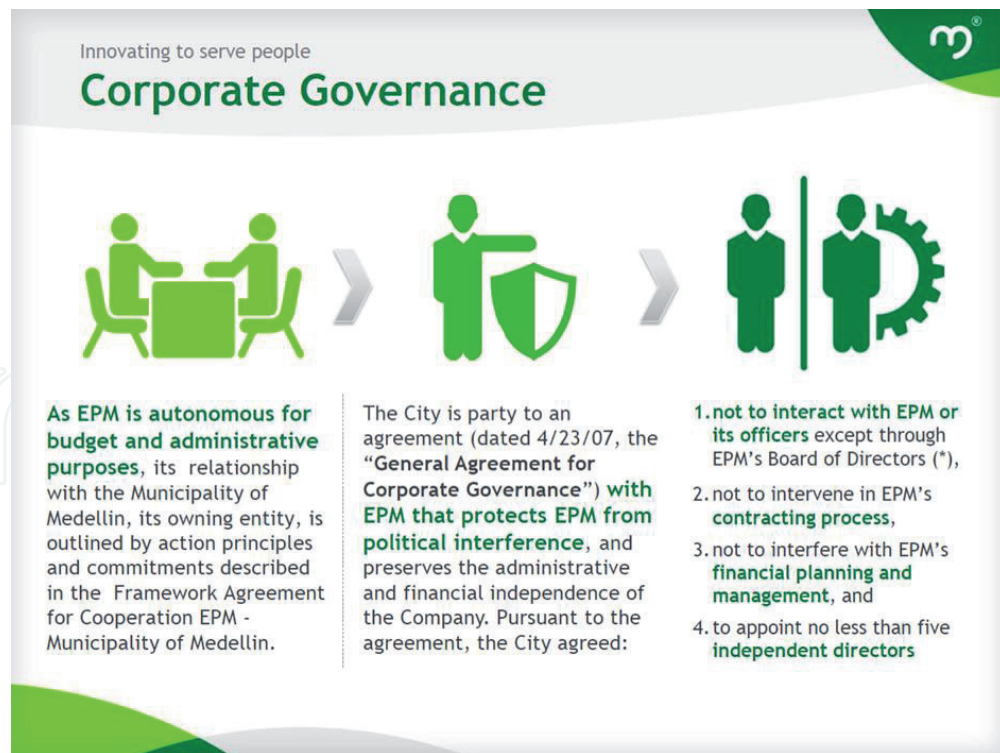
Figure 2. Corporate governance of EPM (examples from agreement between the City and the company) supplementary material from ID1, (EPM, 2016).

This quote is included as an example of how the two actors are arranged in efforts to deliver social goods in the city. Contextually, this quote is taken from a conversation related to the role of EPM and the municipality during and after the transformation which included social innovation efforts by the city and EPM.