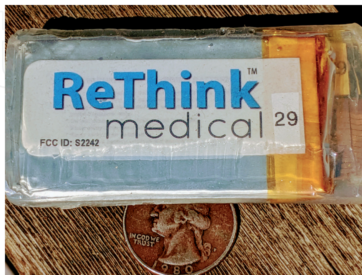
Figure 1. ReThink wireless biosensor with capability to acquire HR, three-dimension accelerometry and respiration data. These data are then transferred to a Bluetooth enhanced personal device, as well as stored there. Quarter is shown for size comparison, with dimensions of 75 mm width, 4 mm height, and 1.4 mm depth (used with permission).