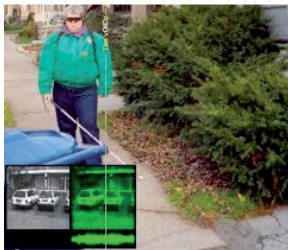
Figure 1. Gadget for future sensory substitution [1].

Besides, at present the most progressive adaptation of visual inserts, retinal prostheses, are actually constrained to giving a restricted field of view because of issues in making inward embeds to fit the anatomical structure of the retina [7].