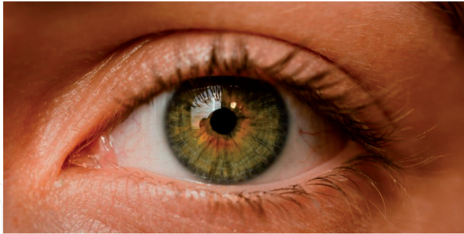
Figure 2. Eye sight complication.

Maybe additional significantly, subsequent sharpness become less compare to anticipated given the number of pixels, on grounds that the interpretation from specialized goals to utilitarian keenness is exceptionally perplexing as shown in Figure 2 .