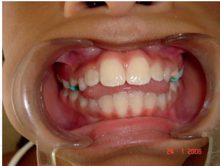
Figure 1. Tongue rest in anterior position and open bite malocclusion.

clinically important, and can impede eruption of the incisors, causing and maintaining the anterior open bite [2].