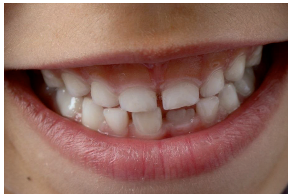
Figure 5. Child with tooth wear.

Extensive tooth wear (TW) can be caused by chemical factors, mechanical factors, or a combination of both. The most common factors associated with TW were daily functions (e.g., chewing); oral habits (e.g., bruxism, nail biting); having a diet full of acid foods or some diseases that involve acids from the own body (e.g., gastric reflux); and also medicines, stress, and salivary dysfunctions [45].