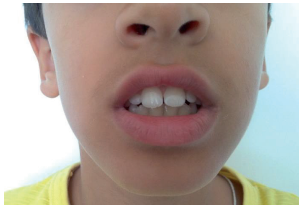
Figure 3. Mouth breather with abnormal lip function, with no sealing.

Sometimes, changing the breath mode to nasal is not enough to avoid the consequences on occlusion. For this reason, we recommend an early intervention on etiological factors of mouth breathing to prevent the development or worsening of malocclusion.