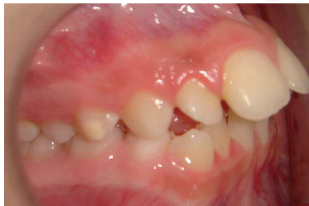
Figure 2. Teeth position influenced by lower lip.

Many clinicians feel that pressures exerted by tongue prevent teeth from erupting in patients with open bite malocclusion. This view amounts to an extension of the equilibrium theory to the vertical plane of space [19]. Lower lip resting pressure affects more the position of the upper incisors rather than the upper lip ( Figure 2 ). In some studies, high lip line was shown as the reason behind the retroclined position of the upper incisors, while in others, the hyperactive lip or mentalis muscle were shown as the reason [20].