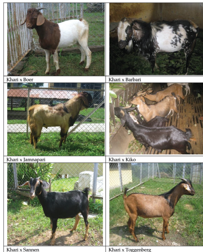
Figure 3. Crossbred goats at Goat Research Station, Bandipur.