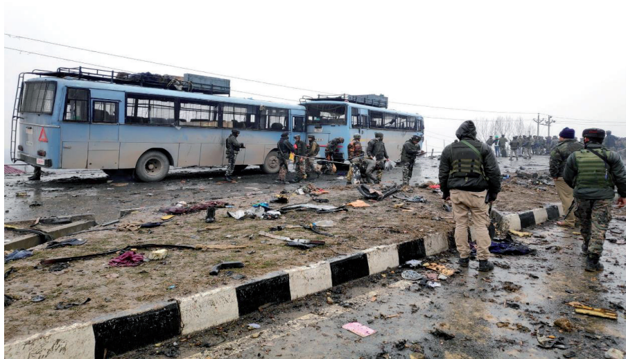
Figure 8. A suicide bombing last week in southern Kashmir killed at least 40 Indian soldiers.

their failure on Pakistani forces and blamed that the attackers were sent from Pakistan ( Figures 7 and 8 ). On the other hand, Pakistani officials clearly denied the Indian officials statement. In addition, the Pakistani government spokesman said: “It is Indian habit to blame Pakistan.” Further, the spokesman offers that we are willing to investigate the case with the Indian government for better regional peace and prosperity.