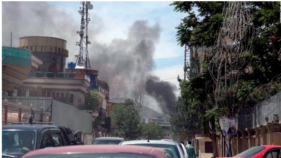
Figure 5. Smokes rises after a terrorist attack in Kabul.