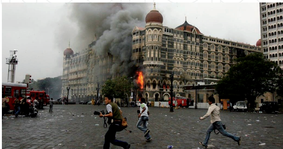
Figure 1. The Mumbai attack in 2008.

There is no doubt that there are many definitions of terrorism. Terrorism is a charged term. It is usually used with the connotation of something that is “ethically and morally wrong”. According to the Global Terrorism Database [1], from 2000 to 2014, almost 61,000 incidents of non-state terrorism, resulting in at least 140,000 deaths.