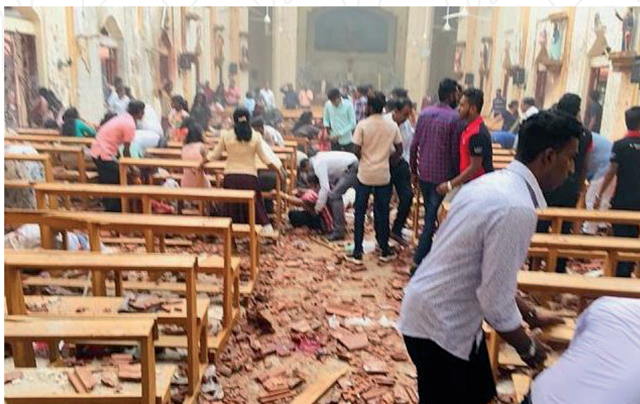
Figure 3. Attack on churches in Sri Lanka.

In February 2019, around 42 Indian soldiers have been killed in a suicide attack in the disputed area of Kashmir. After the suicide attack, the Indian government put