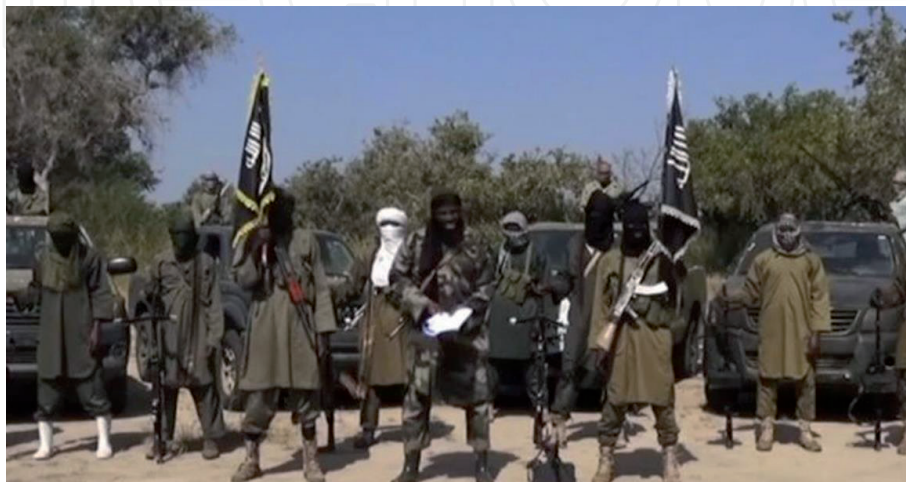
Figure 6. Boko Haram fighters in Nigeria.