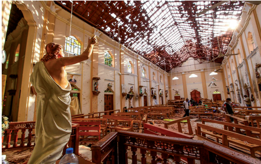
Figure 4. Suicide bombing on Easter day in Sri Lanka.