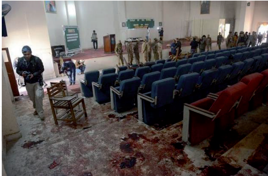
Figure 2. The Army Public School attack in 2014.

In 2019, during the celebration of Easter festival in Sri Lanka, three churches and three hotels were targeted by the terrorist. In the suicide bombings, approximately 258 people were died including 45 foreigners, while the number of injured people was around 500. As per the official agencies, the terrorist was Sri Lankan national and was associated with a local militant group ( Figures 3 and 4 ).