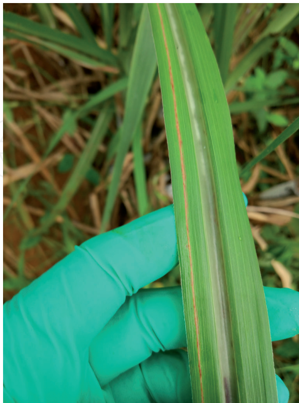
Figure 2. Chronic phase of infection with pencil line stripe.

LSD symptoms were recorded every month in the field. Disease severity was rated according to the procedure described [11]. However, all inoculated sugarcane stalks were rated individually, symptom severity ranging from 0 to 5. The ratings were used to calculate mean disease severity (DS): DS = [(1 \times FL + 2 \times ML + 3 \times CB + 4 \times N + 5 \times D) / 5 \times T] \times 100 . However, FL = number of stalks with one or two pencil-line streaks (rating 1), ML = number of stalks with more than two pencil-line streaks (rating 2),