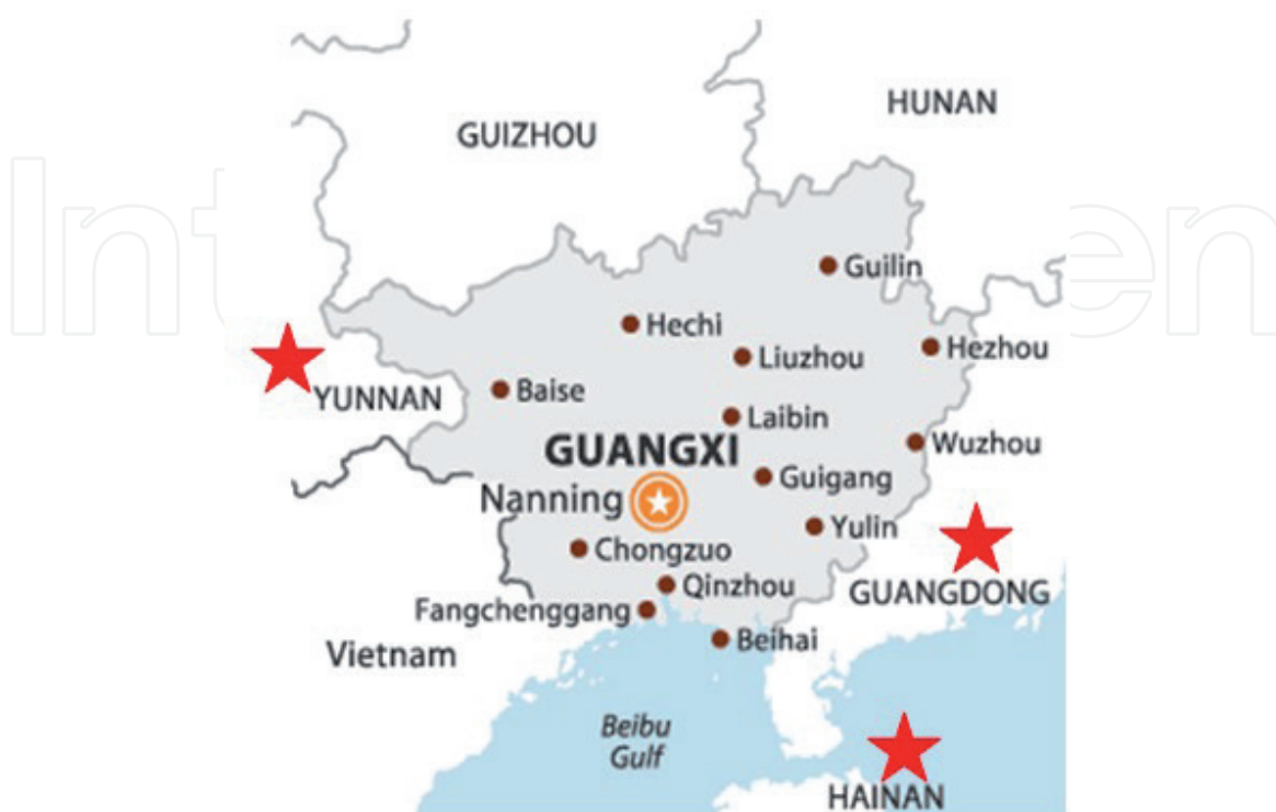
Figure 1. Major sugarcane areas affected by leaf scald in China.

During this period, infected plants do not show any symptoms that occur in tolerant varieties and under favorable conditions for growth of plant. Stress can activate the infected plant to pass from the phase of latent into chronic or acute phase.