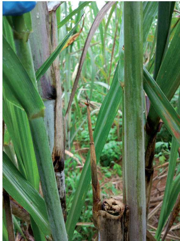
Figure 3. Acute phase of infected plants leads to death.

CB = number of stalks with leaf chlorosis or bleaching (rating 3), N = number of stalks with leaf necrosis (rating 4), D = number of dead stalks or stalks with side shooting (rating 5), and T = total number of stalks. The rating of 5 was attributed to stalks with dead inoculated leaves 1 month after inoculation [11].