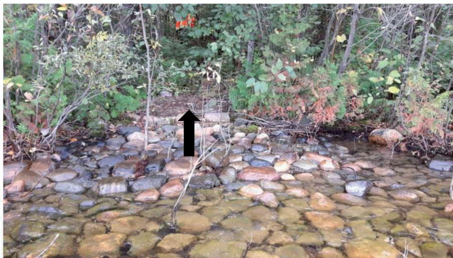
Figure 13. Views of site F. Figure from October 12, 2016, shows the shoreline of Smith's Bay, Lake Huron, with a gap in the vegetation (black arrow) and a person with orange vest standing in front of the wood crib in the background. Inspections of the rocks in the water demonstrated the presence of white particulate residue from the seep and zero SAV in this area, while adjacent areas had SAV [21].

determination was this site represented a natural hydrocarbon seep. A soil test pit survey was conducted to map the hydrocarbon distribution below grade, and chemical analyses tracked the plume 75 m upslope from the shoreline, where the survey ended. The results from this tracking exercise led to the final determination that this was a natural seep, not a lost HEA, as no evidence of infrastructure was found in the area upslope [21].