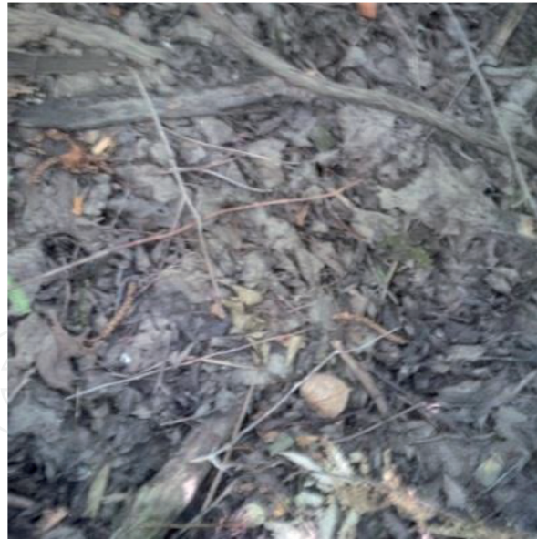
Figure 4. Views from August 2, 2016, show the groundcover and tree overstory at the rotted wood crib at site A. Figure shows a complete absence of live plants within the former wood crib.