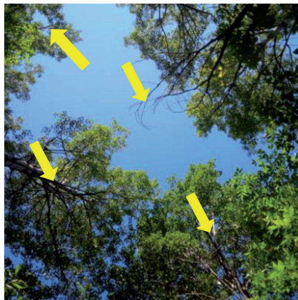
Figure 5. Views from August 2, 2016, show the groundcover and tree overstory at the rotted wood crib at site A. Figure shows dieback of the balsam poplar branches within canopy (yellow arrows) over the former wood crib. Dieback in these overstory branches indicates root death.

demonstrates bare earth along with patches of EPI and a few specimens of other herbaceous species. The overstory trees in this area are codominant balsam poplar and balsam fir; other trees in the area included red maple, red oak, and eastern white cedar away from the channel. Most balsam poplars along the channel were dead; live balsam poplar was set back from the channel and shows dead branches on the side of the channel. Also the balsam fir close to the channel is short, with a height of <2 m, while balsam fir upslope was up to ~15 m tall.