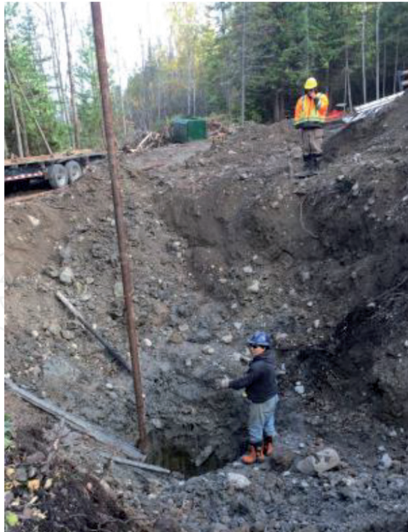
Figure 9. Views of site E with wood crib within the shoreline forest of Smith's Bay. Figure is from November 1, 2016, and shows the excavation in progress with the discovery of a barrel at ~5 m below grade but still 4 m above the well box [21].