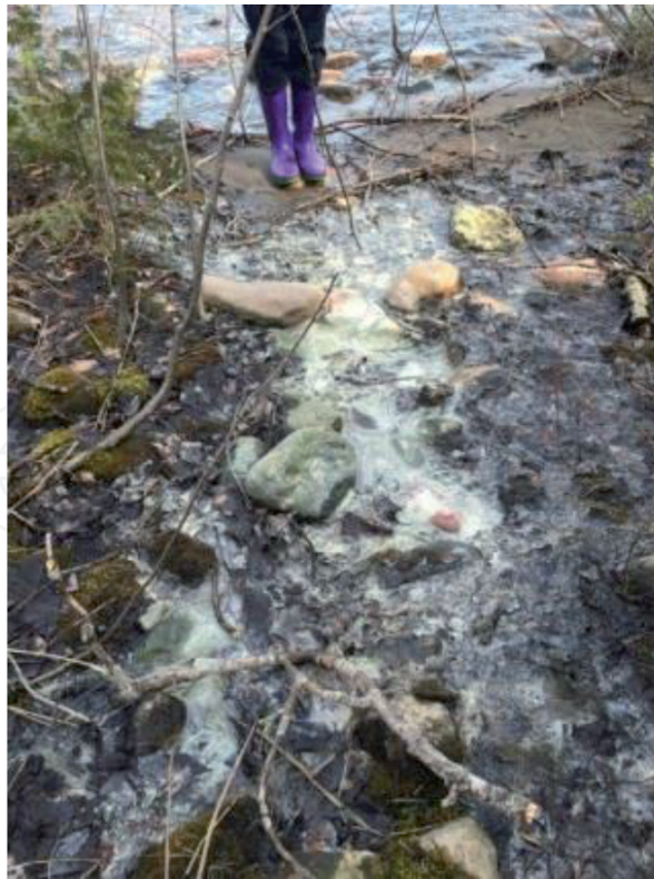
Figure 12. Views of site F. Figure shows the seepage path from site F to the lake on April 29, 2016, with white foam arising from the wooden crib.