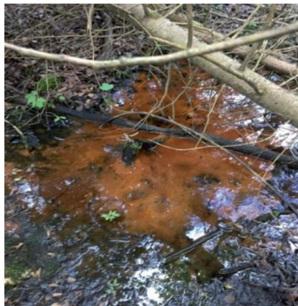
Figure 7. View of site C with iron-stained water that originates from a pipe on September 9, 2017. Figure shows an area in very close proximity to the pipe, with very low density of plants with those evident showing severely stunted size.

the channel ( Figure 6 ). For the EPI in this area, it showed a gradient of responses to exposure to channel, based on distance to the water. Eastern poison ivy specimens that were in direct contact with the water had all three leaves showing red color, while other specimens on the channel above the water line had leaves that were red on the water side and yellow-green leaves upslope of the water. The EPI away from the channel demonstrated less yellow and red color in the leaves with green color evident. In contrast, specimens of EPI found in a short distance upslope had bright green leaves with no discoloration ( Figure 6 ). The area closest to the pipe had a few very small plants evident ( Figure 7 ). It is inferred the direct contact with water is triggering the rapid onset of chlorosis in leaves. Stunted plant height is attributed to exposure of soil to brine in the past. These phenological responses to brine exposure suggest a mechanism to explain the paucity of plant species, reduced height, and low areal coverage.