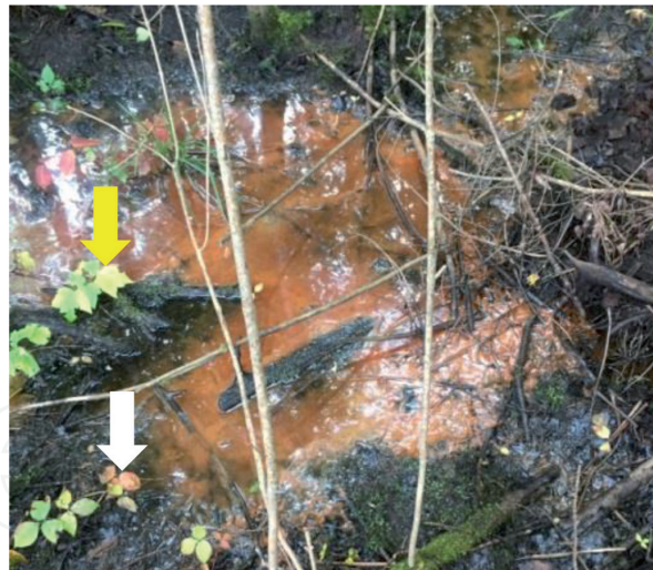
Figure 6. View of site C with iron-stained water that originates from a pipe on September 9, 2017. Figure 6 shows an area that is in close proximity to the pipe, with chlorosis evident in red maple sapling (yellow arrow) and EPI (white arrow).