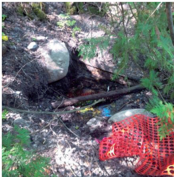
Figure 10. View of site F near the shoreline of Smith's Bay, Lake Huron, on June 29, 2016. Figure shows how the wood crib exists over a natural hydrocarbon seep, about 20 m upslope from Smith's Bay.

Site F was approximately 100 m west of site E within the shoreline forest of Smith's Bay, Lake Huron, and was about 20 m upslope from the shoreline. Site F included a wood crib that measured 1.8 by 1.8 m and contained water ( Figure 10 ). After the wood crib was removed, the area was scanned using EMI, similar to site E. This EMI scanning identified no pipes or other metal infrastructure at depth but suggested that groundwater was close to the surface [21]. During abandonment, no metal well pipe was found, but extensive volumes of groundwater were observed within 1 m below grade. The overstory trees in the area were eastern white cedar; however, no mature specimens were evident at the HEA, as it was dominated by