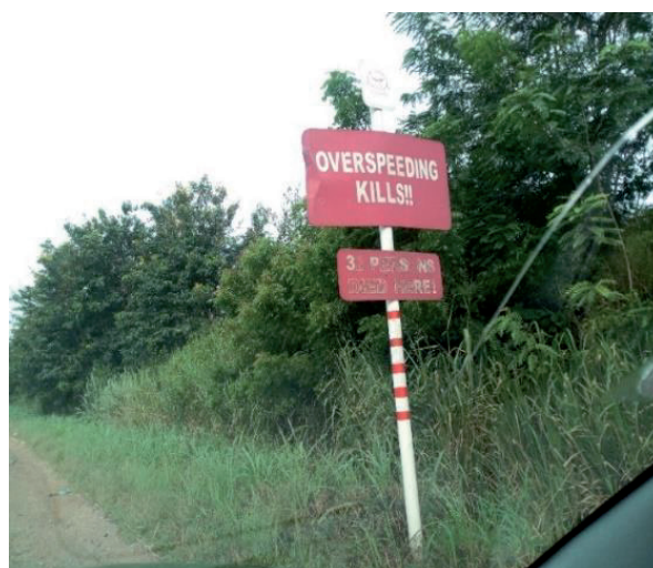
Figure 2. Billboard indicating previous accidents on some spots on the highway.

training (n = 16 or 20%), they claimed it was just talk-based with a little demonstration. The rest acquired appreciable knowledge through years of rescue care for RTA victims.