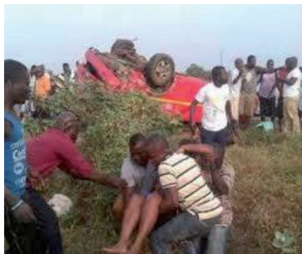
Figure 5. Some community residents assisting RTA victims.

Our ability to rescue victims from crashed vehicles depend on the extent of damage to the vehicle. We lack the necessary equipment to cut open accident vehicles. Mostly, we use cutlass, axes and any available tool to cut the vehicle in order to get the victims out. We end up injuring ourselves in the process (Male, 35 years, Gomoa Mprumem).