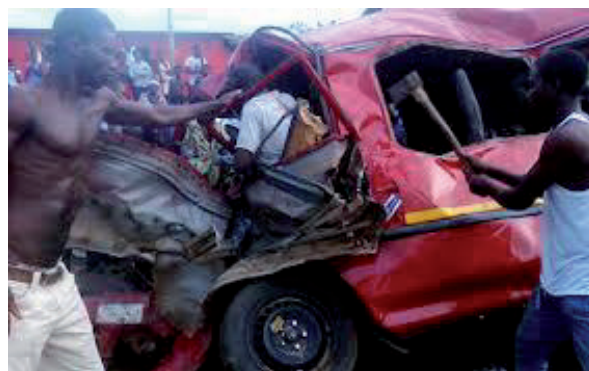
Figure 3. Residents trying to rescue victims stacked in a vehicle.

Notwithstanding, we noted that the rescue efforts were often saddled with challenges. The major challenge we noted was the lack of proper tools to cut open vehicles in order to bring out trapped victims. There was also the difficulty of rescuing victims in burning vehicles. Some respondents revealed sustaining burns and deep cuts by the broken glasses of the crashed vehicles in the process of rescuing victims.