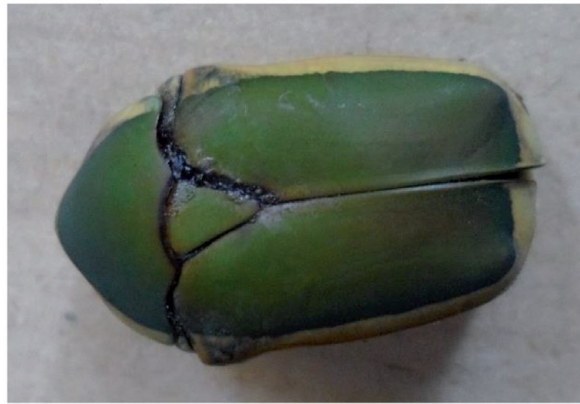
Figure 3. Adult dried cetonia ( Cetonia aurata ) in Cameroon Western highlands.