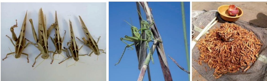
Figure 5. Migratory locusts (greyish and greenish) and dried in North Cameroon.