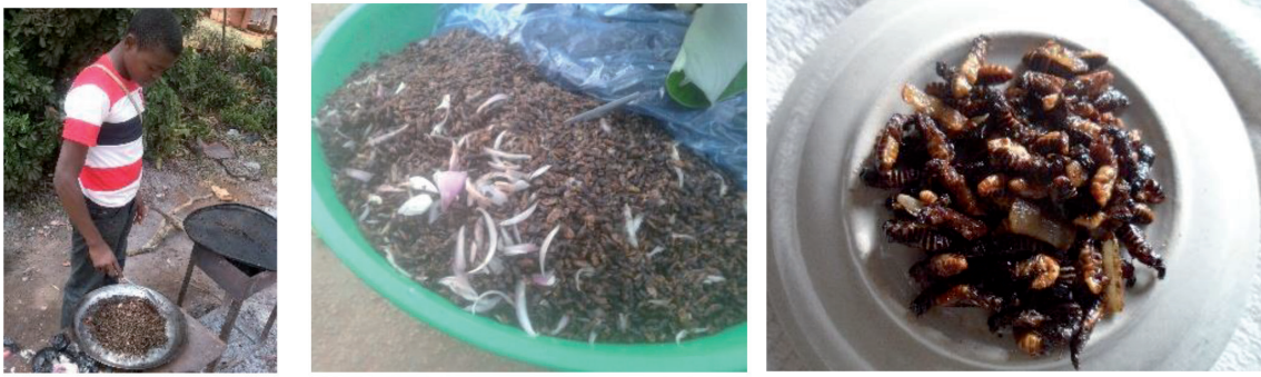
Figure 2. Processing of termites ( Macrotermes sp.) and selling packages in Cameroon.