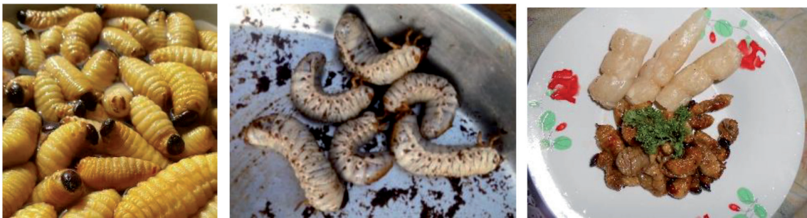
Figure 4. Palm weevil grubs ( Rynchophorus sp.) and a dish made with in Cameroon.