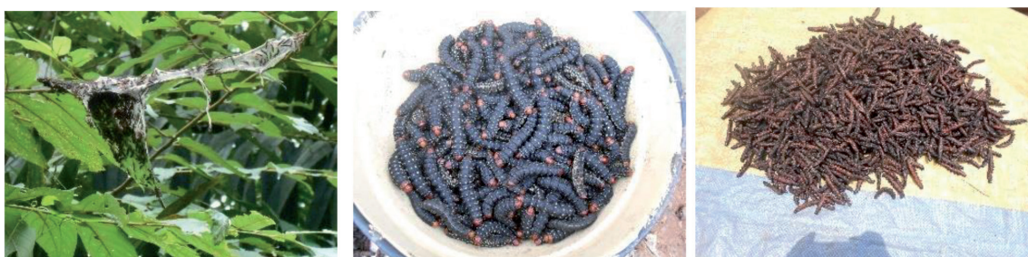
Figure 1. Edible caterpillar nest and heap of fresh and dried ones ( Imbrasia sp.).

The acridians or grasshoppers (Orthoptera), Locusta migratoria (also Schistocerca gregaria ) known as migratory locusts are commonly exploited in drier regions of Cameroon ( Figure 5 ), whereas Ruspolia differens , Tettigonia viridissima and Zonocerus variegatus are exploited in humid environments in southern Cameroon [10, 14]. Zonocerus sp. is treated with care because of toxins if not well prepared before ingestion.