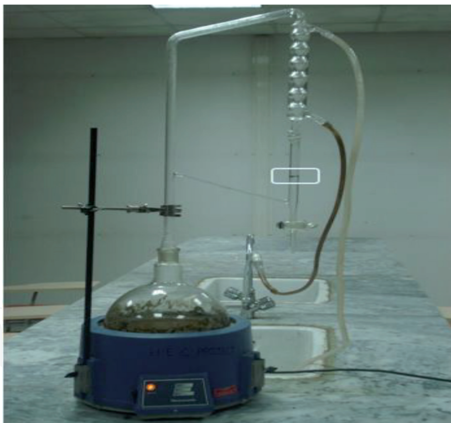
Figure 2. Hydrodistillation apparatus used for the extraction of essential oils.

spectroscopy [14]. The enhanced demand for the essential oil in various fields of life provoked us to access the reliable methods for the essential oil analysis, and the techniques used are the GC-MS and GC analyses [15]. The characterization of the essential oil was carried out by using the gas chromatography. The compounds that are present in the essential oil was confirmed by using the GC and GC-MS analysis [16]. The storage and handling of the essential oil also affect its yield and quality, and essential oil was deposited in the oil glands that are present in the organization of the plant material [16].