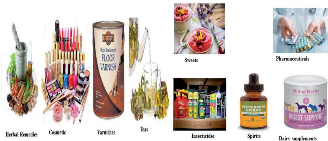
Figure 3. Modern trends of essential oils.

Essential oils are widely used in perfumes, personal hygiene products, and in aromatherapy including the inhalation, massage, masking agent to avoid the unpleasant odor in the textile industries, paint and plastic industries, and pharmaceuticals formulations. Essential oils are also used as the natural antifungal and antibacterial agents in the food safety items; essential oil also used in the various kinds of cereals, antimicrobial packing of the food items, edible thin film, nano-emulsion, preservation of the fruits and vegetables, soft drinks, as the flavoring agents in the carbonated drinks, as the major ingredients in soda/citrus concentrates, seafood preservations, fish, etc. ( Figure 3 ) [22].