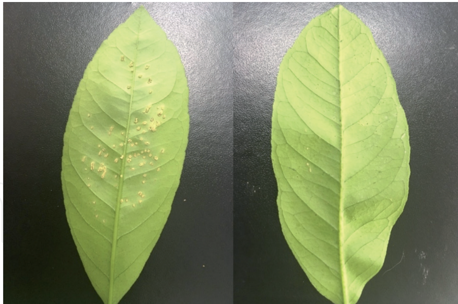
Figure 2. Virulence assay. Leaves infected by spray method at the same concentration 1 \times 10^6 UFC/mL. Left, Xcc wild type. Right, Xcc plus Pseudomonas oryzihabitans . Picture was taken after 21 days of infection.

Quorum quencher bacteria impaired the attachment and biofilm formation of Xcc to leave the surface. These are essential steps in the maintenance, survival, and initial establishment of tissue pathogenicity in citrus canker. In fact, it is completely accepted that QS plays an important, if not an essential, role in the formation of bacterial biofilm [34]. Studies of scanning electron microscopy SEM confirmed the substantial reduction in the adherence ability of Xcc after 10 hours when it was co-infected with quorum quencher bacteria relative to the control used, i.e., the leaves infected with Xcc alone. After 7 days post-infection with Xcc and the inhibitory bacteria of DSF, SEM has shown the absence of biofilm formation on the surface of leaves co-inoculated with P. oryzihabitans and B. amyloliquefaciens , relative to the control used, i.e., the infected leaves just with Xcc.