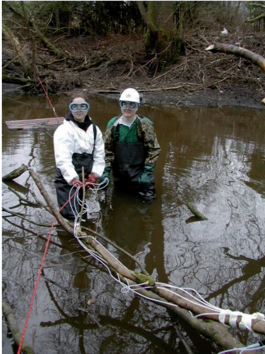
Figure 2. Hyporheic zone multilevel sampling of the bed of Polmadie Burn, Glasgow. Note how, for ease of access, the multipoint sampling tubes were extended from the sampling point to the base station where the peristaltic pump was deployed.

the hyporheic zone water composition. It was concluded that the low-permeability alluvial sediments imposed a limit on the effectiveness of the hyporheic zone for enhancing Cr surface water quality at the reach scale. This was also evident in the surface water quality synoptic sampling which showed only moderate to low downstream decreases in surface water chromium concentrations. Thus, the key finding was that although the geochemical potential for hyporheic attenuation of surface water chromium was clearly established, the hydraulic functioning of the hyporheic zone was limited by poor hydrological connectivity with the Polmadie Burn.