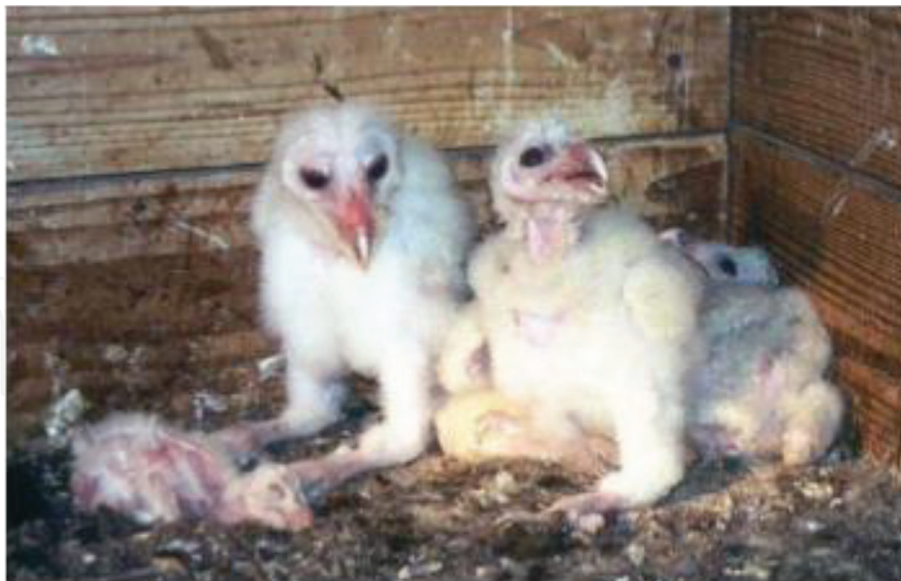
Figure 5. Age difference among barn owl chicks. The one in the middle is the oldest at 14 days old, the one lying down at the extreme left is the youngest at 4 days old, and there is an egg at the centre that is not hatched yet.

The implication of the age difference is the nature's unique way of controlling for food availability. In case of food scarcity, it is expected that the older and stronger chicks would survive, and hence, the parents would usually have offspring to continue their generation. However, when food is available, the tendency that all the chicks would survive is high.