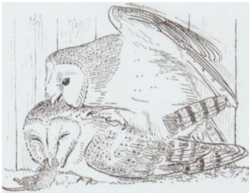
Figure 4. Copulation of owls, the female holding the male's gift in her bill. Source: König, Weick and Becking [10].

Copulation may follow once the female accepts the food ( Figure 3 ). In order to initiate breeding among owls, they call and sing. The song plays two important roles, which are for claiming the territory and to attract mates, although the male's song exercise reduces drastically after pairing [9, 10, 59]. Owls looking for mates may sing endlessly until a mate is found. The uniqueness of the female's song over the male's lies in higher pitch and clarity. Males of Tengmalm's owls ( Aegolius funereus ) are known to utter only a few phrases of song whenever they bring food for their mates [9, 10, 59]. Copulation among