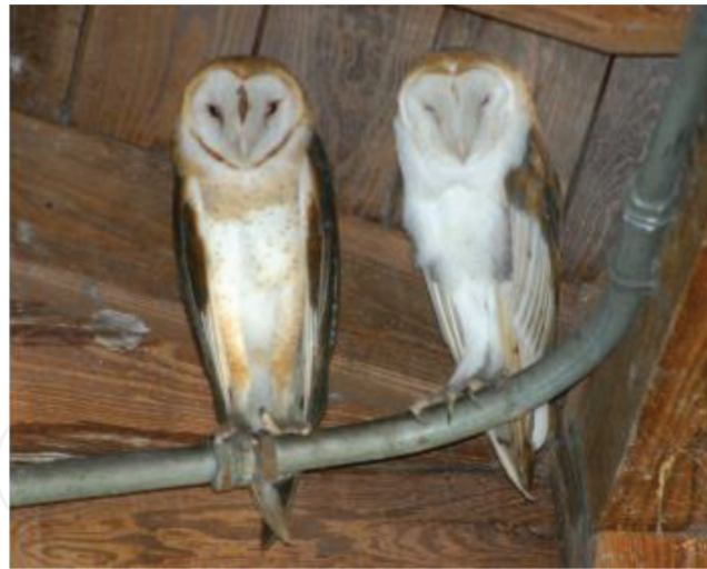
Figure 1. Barn owl: lighter colour male (right), female with spottiness (left).

Some of the known and well-studied species of owls are the barn owls ( Tyto alba ), which are sometimes referred to as ghost owls or monkey-faced owls [2], Ural owls ( Strix uralensis ), spotted owls ( Strix occidentalis ) and tawny owls ( Strix aluco ). Barn owls are easily identified by a white or tan underside with black spottiness. The females tend to be darker than the males which are whiter [2]. However, the females