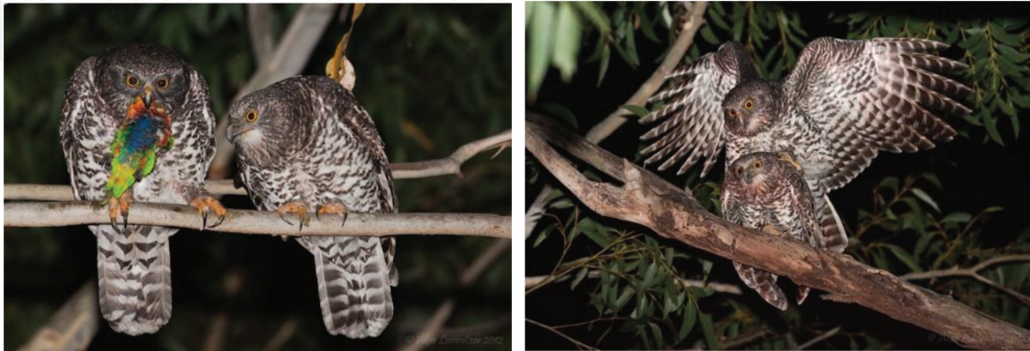
Figure 3. Owl pair courtship feeding and copulation, female is attracted by food (left); copulation followed acceptance of food (right). Credit Ákos Lumnitzner (Lewis [61]).

Courtship involves calling. The male calls to the female for attention, to attract the female to a suitable nest, although this may vary from one species to another. The calling may be accompanied with the provision of food, by displaying the prey animals.