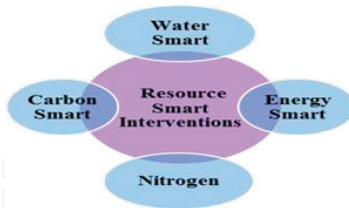
Figure 3. Resource (water, carbon, nitrogen and energy) smart interventions.

crops (pearl millet, sorghum, quinoa etc.) and started to prepare their lands for cultivation. Applying the right source of N, at the right rate, at the right time, and in the right place is another important aspect in nitrogen management. In climate smart interventions, farmers must use leaf color charts, handheld crop sensors, and nutrient decision-maker tools to decide the most appropriate dosage of nitrogen fertilizers for crops. The use of crop canopy sensors is a good example of the interventions and an important precision agriculture tool into the decision-making process. These interventions not only save costs, but also cause decrease in greenhouse gas (GHG) emissions especially from puddled rice fields [32].