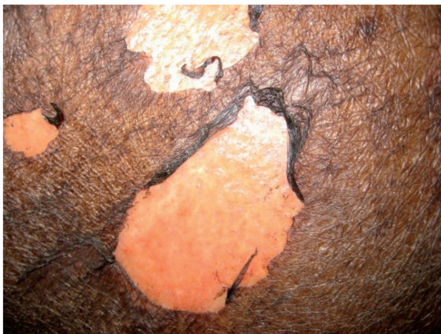
Figure 3. Typical appearance of toxic epidermal necrolysis (TEN).

TEN is a severe, life-threatening disorder (with a mortality rate approaching 40%) characterized by generalized loss of epidermis and mucosa ( Figure 3 ), typically involving more than 30% of the skin [215]. A tell-tale clinical finding that is almost always present in TEN is the phenomenon in which intact superficial epidermis can, via a pushing or shearing force, be dislodged and slid over underlying layers of skin; this indicates a plane of cleavage in the skin at the epidermal-dermal junction and is referred to as Nikolsky’s sign [216]. TEN is almost always medication-induced and involves a cytotoxic T-cell reaction with apoptosis of keratinocytes mediated by Fas ligand [217]. Consequently, the first step in treatment is similar to that of a burn injury—stop the underlying causative agent (i.e., discontinue all medications that are not essential). The next step is to confirm the diagnosis through a careful medication history and skin biopsy with frozen section. The finding of full-thickness epidermal involvement distinguishes TEN from other conditions such as staphylococcal scalded skin syndrome (see