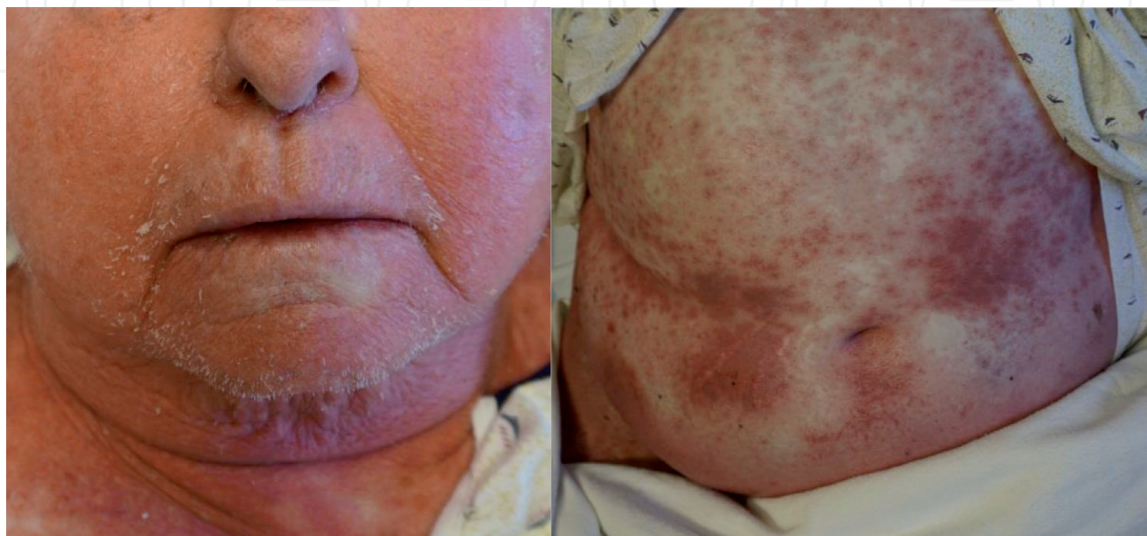
Figure 4. Typical appearance of staphylococcal scalded skin syndrome (SSSS). Left—face; right—abdomen.

Necrotizing fasciitis refers to the severe and rapid destruction of skin, subcutaneous fat, and muscle caused by bacterial infection (e.g., group A streptococci,