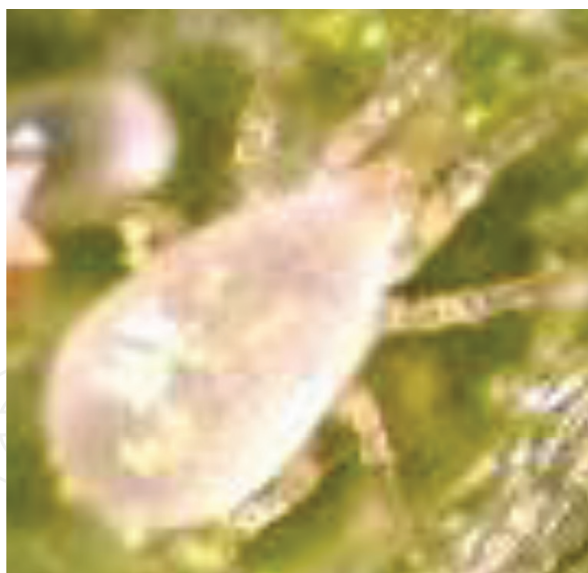
Figure 8. Neoseiulus pseudolongispinosus .

amplified too on T. aestivum daily (3.5 per day), but reduced (2.8 and 1.2 per day) with Z. mays and G. max , whereas, the total growing time observed 10.1, 11.8 and 12.9 days, correspondingly. A calculation of macronutrients in wheat, soybean and maize flours displayed that wheat has additional ash and carbohydrate, and on the other hand decreased fat and protein contents, as a result, it evidenced as a prominent compound to support greater mite densities [88].