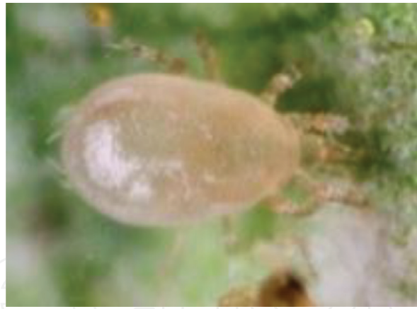
Figure 4. Neoseiulus californicus .

(cyclamen mite, strawberry mite); P. latus (broad mite, yellow tea mite, citrus silver mite); Raoiella indica Hirst (red palm mite); Brevipalpus spp.; Panonychus ulmi (European red mite, fruit tree red spider mite); Tetranychus cinnabarinus (Boisduval) (carmine spider mite, cotton red spider mite) in flowering crops; fruit-bearing vegetables; ornamentals (protected); spice crops; berries; and grapes. Promoting preservation of N. californicus can furthermore be done on an extensive range of crops. Appropriate crops comprise ornamentals (gerbera, chrysanthemum, rose), vegetables (capsicum, eggplant, cucumber) and herbs. It is frequently used in greenhouse crops production, however, can as well be used in the field, mostly fruit crops like as pome, melons and stone fruits [58].