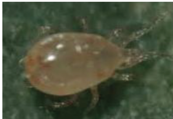
Figure 1. Neoseiulus cucumeris .

Cucumeris predatory mite Neoseiulus (= Amblyseius ) cucumeris (Oudemans) has a worldwide distribution because of its natural occurrence and commercial use in various parts of the ecosphere. Cucumeris is soft-bodied and translucent pale brown to sometimes tan-colored depending on the food consumed. These can be distinguished from most pest mites by their shape and mobility ( Figure 1 ). Cucumeris moves rapidly along the underside of leaves and in flowers of plants. Adult mite is pear-shaped and may range between 0.5 and 1.0 mm in length with long legs. Gnathosoma corniculi is slightly convergent distally, dorsal shield strongly reticulate with 17 pairs of setae, and sternal shield smooth with few lateral striae, three pairs of setae and two pairs of lyrifissures. Eggs are laid on the leaf surface, on domatia or on hairs (trichomes) along the midrib on the underside of leaves and occasionally on petiole hairs. The eggs are round, translucent white and measure 0.14 mm in diameter. Females lay 1–3 eggs per day for an average of 35 eggs over their lifetime. The eggs hatch in about 3 days later [35].