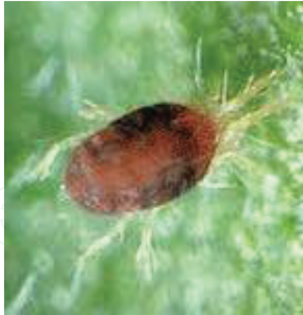
Figure 11. Tetranychus cinnabarinus .

Development times of the carmine spider mite T. cinnabarinus have been evaluated in the laboratory on excised leaf disc of lablab bean Dolichos lablab L., at 30 \pm 2^\circ\text{C} and 70 \pm 5\% relative humidity. Total development times from egg to adult stage have been noted 7.33 \pm 0.13 days. The pre-oviposition period, oviposition period and post-oviposition period noted 0.5 \pm 0 , 8.05 \pm 0.14 and 0.65 \pm 0.07 days, respectively. Fecundity averaged 42.5 \pm 1.7 eggs and longevity lasted for 9.2 \pm 0.13 days [114].