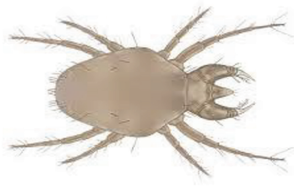
Figure 9. Cheyletus eruditus .

It is widespread and abundant in grain stores especially those that have significant storage mite problems. Maximum accounts of C. eruditus are from stored foods (commonly whole grains and flour) intended for domesticated animal and human feeding. Left over densities frequently persist in storing basins and premises afterward the substances have been removed. It as well establishes in animal bedding, nests of mammals and birds, house dust, poultry litter, and occasionally in field habitats, e.g., soil, haystacks and plant debris. For commercial use, it is reared on storage mites particularly Acarus siro (Linnaeus), and is the only biological control agent used to control pest mites in food storage systems, for example, in grain and