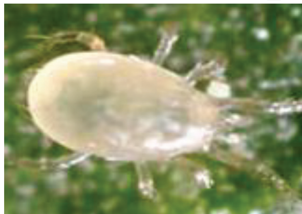
Figure 5. Amblyseius swirskii .

Species A. swirskii is commonly used to control whitefly and thrips in greenhouse vegetables (especially cucumber, pepper and eggplant) and some ornamental crops, and other pests on citrus and other subtropical crops. The mites are released directly in the crops in bran or vermiculite carriers sprinkled on the leaves or substrates, or may be broadcasted via air blast or other automated distribution technique. The recommended release rates are typically between 25 and 100 mites per m 2 depending on pest species, pest density and type of crop [70, 71].