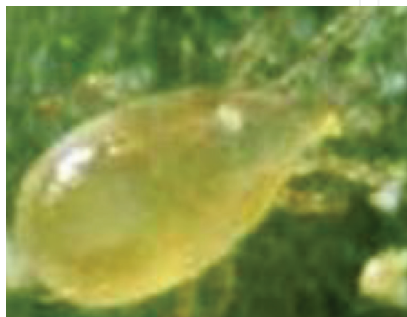
Figure 6. Amblyseius barkeri .

It is used against various thrips species and broad mite as well as other tarsonemid mites in greenhouses and indoor plantscapes. It works well on P. pallidus (cyclamen mite) and P. latus mites (broad mite, yellow tea mite and citrus silver mite). Mites pierce the instars of their prey and suck out the internal organs to eat, but do not eat adults. It is found as wild populations on cut flowers (orchids,