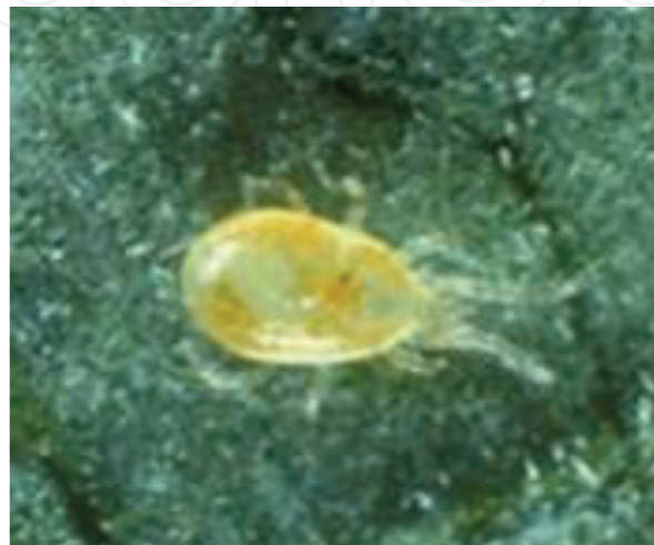
Figure 2. Neoseiulus fallacis .

Adults of N. fallacis are about 0.5 mm long, with pear-shaped bodies. These can vary in color from cream to orange-beige, shiny and semi-transparent, with long legs ( Figure 2 ). The immature stages are generally a semi-transparent cream color and difficult to see without a microscope. The eggs are oval, almost transparent, and 0.33 mm in diameter (double than size of a two-spotted spider mite egg). Adult females lay 1–5 eggs per day along the ribs on the undersides of leaves and a total of 26–60 eggs over their lifetime (which could be between 14 and 62 days) are laid. The eggs hatch in 2–3 days and newly hatched predators do not eat, but later stages and adults feed on all stages of prey. Generally, female A. fallacis can eat 2–16 spider mites per day. Of the five N. fallacis life stages, only the first nymphal stage is six legged, while all other post-egg stages have eight legs [44, 45].