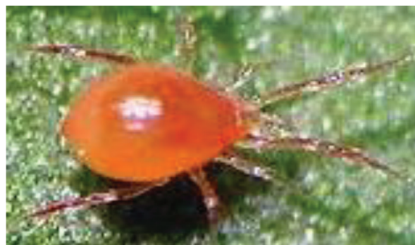
Figure 3. Phytoseiulus persimilis .

Predator mite Phytoseiulus persimilis Athias-Henriot, is a specific predator of web-spinning spider mites like two spotted spider mite. Indeed, P. persimilis nourishes, breeds, and completes growth merely on mites in the subfamily Tetranychinae, even though it too feeds on young thrips and may be cannibalistic at what time spider mite prey is absent [49]. This species is approximately 0.5 mm long, fast moving, orange to bright reddish orange in color, has a teardrop-shaped body, long legs and is slightly larger than its prey ( Figure 3 ). Adult females are reddish, pear-shaped and active at room temperature. Immatures and males are smaller and lighter in color. The life cycle of P. persimilis has been determined under a diurnal temperature cycle of 58–83°F. Eggs are oval, oblong and approximately twice as large as the pest mite eggs and hatch in 2–3 days. The adult female may lay up to 60 eggs during its 50 day-long lifetime at 17–27°C. The adult female, after a pre-ovipositional (the time between emergence from the egg to the deposition of the first egg) period of 3.0 days, laid an average of 2–4 eggs per day for 22.3 days. The average duration of incubation for both males and females is 3.1 \pm 0.2 days [50].