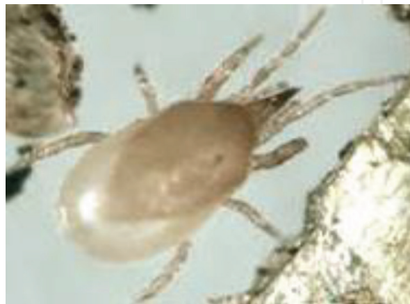
Figure 7. Amblyseius andersoni .

Predatory mite A. andersoni is a predator that forages on several kinds of tiny arthropods prey and pollen. It is broadly described as a predator of spider mites on fruit crops such as grapes, raspberries, peaches and apples, and many conifers. This predatory mite feeds on numerous diverse pest mites such as gall mite, russet mite and spider mite. Its foremost target pests are spider mites Tetranychus spp., ( T. urticae and T. cinnabarinus ), broad mite and cyclamen mite ( P. latus and P. pallidus ), European (or citrus) red mite ( Panonychus spp.), broad mites and Eriophyid mites including the tomato rust (or russet) mite Aculops lycopersici Masee (Eriophyidae). These mites can also survive on young larvae of thrips, flower pollen, sugary excretions from pests and fungi, and gall midges, so, these can be introduced before the prey is present. These feed on and control all stages of phytophagous mites with all mobile life stages of A. andersoni to forage on prey. It is an excellent choice for pre-emergent control of pest infestations because of their varied diet and ability