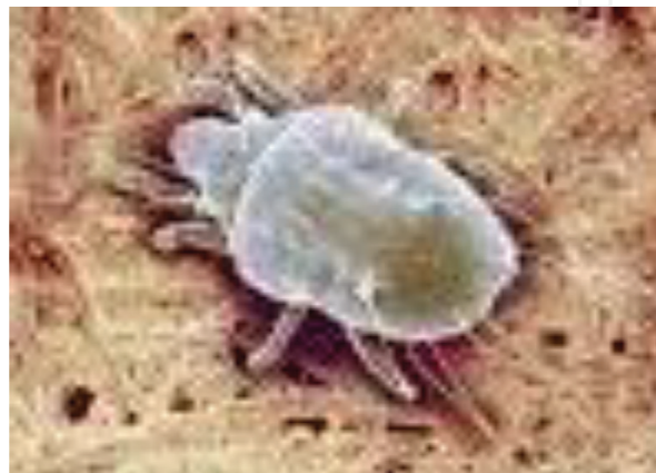
Figure 12. Tyrophagus putrescentiae .

Under optimum conditions, a generation can be completed in 8–21 days. As the temperature falls, the length of the life cycle increases greatly. This mite will tolerate high temperatures, and the larval stage is particularly susceptible to low and high