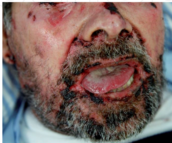
Figure 1. Severe erosive mucositis with hematic crusting on the lips and oral mucosa.

Lesions can also affect regions such as the oropharynx, esophagus, stomach, duodenum, large intestine, conjunctiva, and anogenital region [2, 3, 7, 39, 41, 44, 45]. The involvement of the oropharynx and esophagus commonly triggers painful sensations and dysphagia [4]. The anogenital lesions demonstrate red-violet erythema in the glans or its surroundings ( Figure 2 ). In some cases, lichen planus presents a possible differential diagnosis. However, unlike red-violet lesions, lichen planus forms linear white streaks that may arise in the glans, scrotum, and vulva, in addition to the presence of dyspareunia and pruritus [43]. In these patients, both necrosis and loss of epidermis are absent, unlike patients with PNP who present this clinical [43].