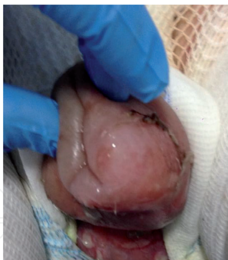
Figure 2. Red-violet lesion in the genital organ.