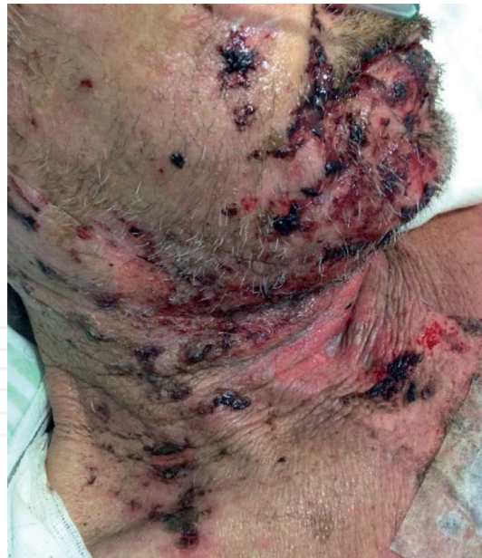
Figure 4. Confluent erosions with hematic crusts in the head and neck region.

Already erythema multiforme shows prodromal symptoms such as fever and myalgia before the appearance of lesions on the mucosal and skin. Their skin lesions change in feature according to the course of the disease and resemble insect bites or hives that result in the well-known targetoid lesions that are common in this disease. Although cases of necrosis and blisters occur in the center of the lesions, this disease shows less aggression and fewer blisters and ulcers with hematic crusts than the patients affected by PNP [42].