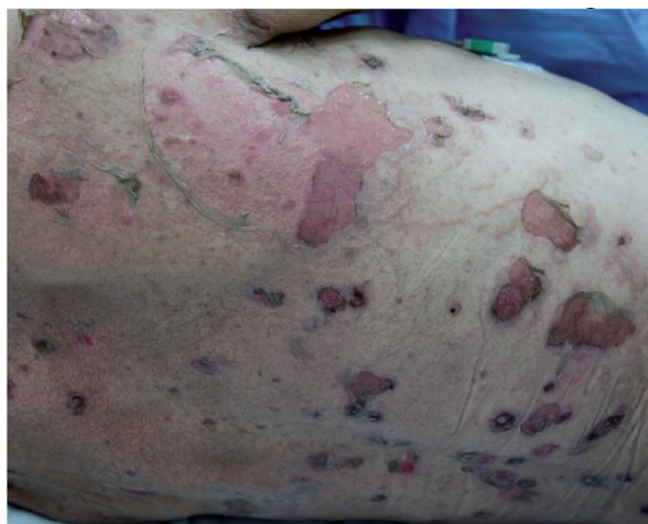
Figure 3. Extensive erosions and blisters in the dorsal region.

About 70% of the patients present conjunctival lesions such as bilateral bulbar conjunctival hyperemia, diffuse papillary tarsal conjunctival reactions, conjunctival epithelium desquamation, forniceal shortening, painful ocular irritation, poor vision, conjunctival and corneal erosions, and pseudomembranous conjunctivitis [2, 46, 47].