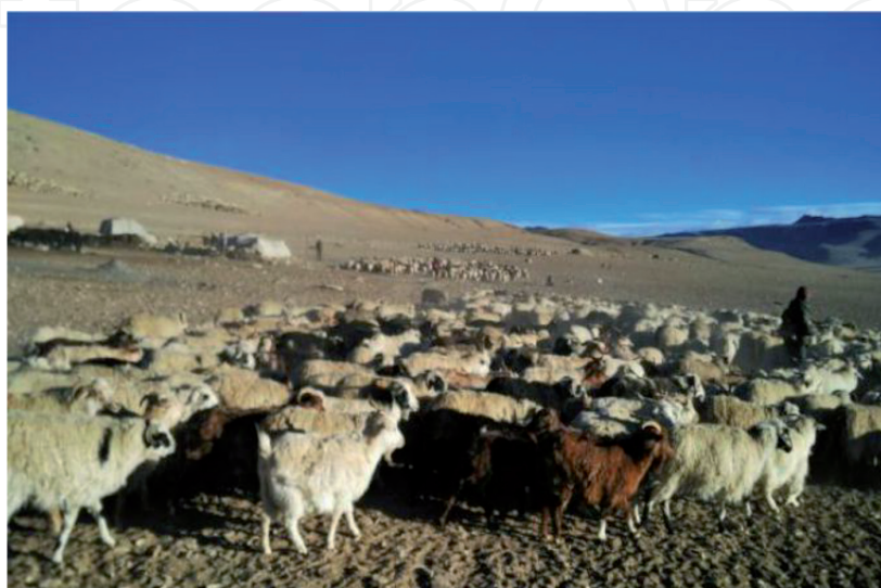
Figure 1. Pashmina goats leaving for grazing.

This goat ( Capra hircus ), a mammal belonging to subfamily Caprinae and family Bovidae produces fine, soft and much straighter double fleece of hair called guard hair. These goats are of medium type, their height ranges from 60 to 80 cm. The average weight of male and female pashmina goats is about 45 and 35 kg respectively. They possess wide horns; have blocky builds, and refined features. Pashmina goats occur in different colours. White tends to be dominant but black, brown, red, cream, grey and badger faced are very common. These goats tend to be alert and cautious, rather than docile and placid. These traits are largely due to their feral ancestry, relatively only a few generations back ( Figure 1 ).