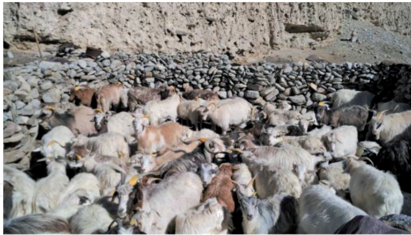
Figure 3. Pashmina goat paddock fenced with stones.

pashmina goats found in the Ladakh region of Jammu and Kashmir. Pashmina yield by bucks is lower and a relatively higher yield by does. These goats are very poor in milk production. On an average a female goat can produce 200–500 ml daily. Pashmina yield per annum in Changthangi goats is about 80 g at first clip, 150 g at second clip, 230 g at third clip, 200 g at fourth clip and 210 g at fifth clip. The length of fibre is observed as higher in males than females [10].