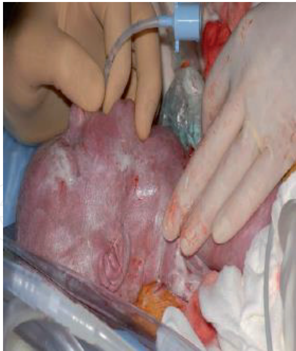
Figure 2. Successful oro-tracheal intubation during the EXIT procedure.

monitors, fetal airway establishment during surgical intervention then delivery was completed with, transition of the baby to postnatal care, and finally completion of cesarean section ( Figure 2 ) [30, 31].