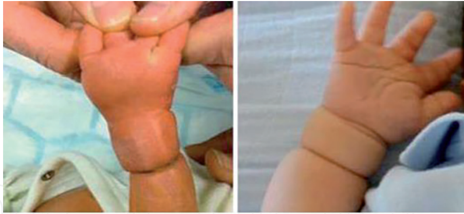
Figure 4. Some amniotic bands may constrict fetal limbs, and may be serious to cause limb amputation.