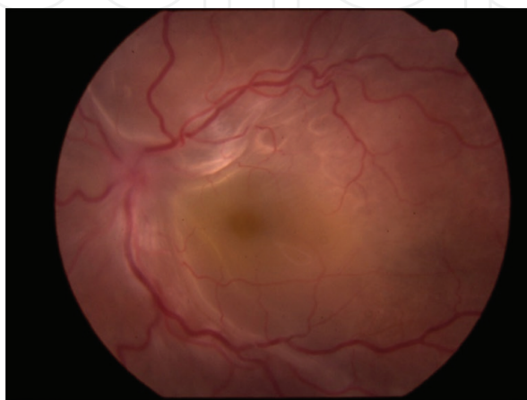
Figure 1. Color fundus photo showing extensive areas of subretinal fluid and bullous serous retinal detachment in a 37-year-old female with VKH.

In addition, integumentary findings may be seen in some patients. In this regard, alopecia, poliosis, and vitiligo are classic signs related to pathological autoimmune response directed to pigmented tissues ( Figure 3 ).