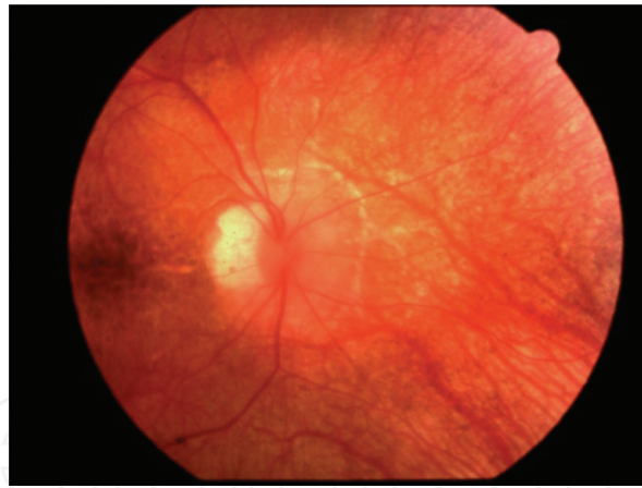
Figure 2. Extensive fundus depigmentation in a VKH patient after 1 year of disease onset. Note the characteristic “sunset glow” appearance of the fundus.