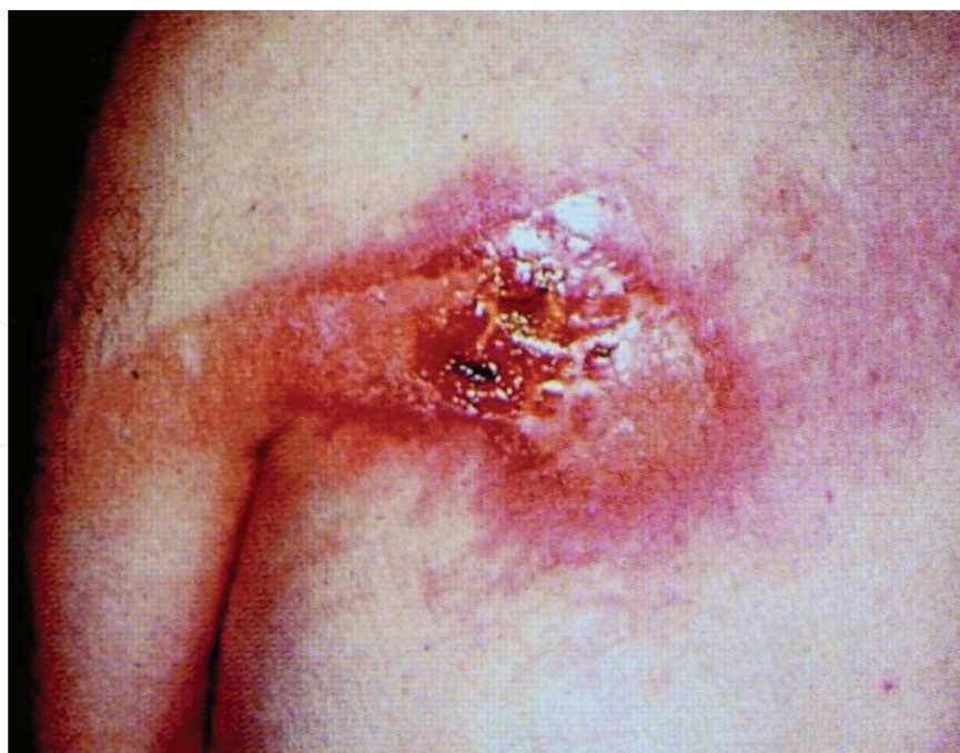
Figure 8. Secondary ulceration after two months for a 69-year-old patient underwent two angioplasties of left coronary artery within 30 hr [12].