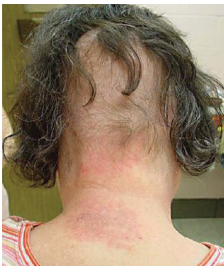
Figure 11. Radiation injury in a 60-year-old woman subsequent to successful neurointerventional procedure for the treatment of acute stroke [11].