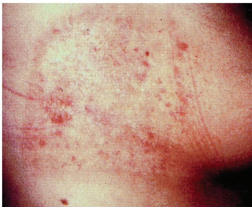
Figure 9. Skin telangiectasia after 2 years for a 17-year-old patient underwent two cardiac ablation procedures within 13 months [12].