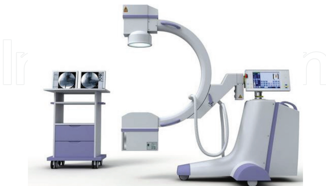
Figure 4. Modern C arm X-ray machine (large).