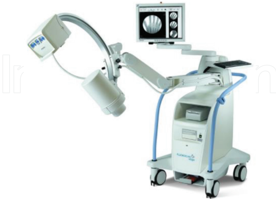
Figure 5. Mini C arm X-ray machine used for pediatric and extremities (1/10th of large C arm dose).