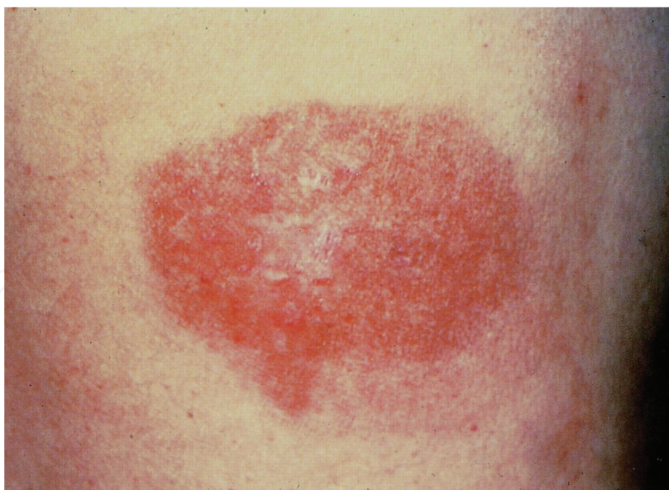
Figure 7. Photograph of right posterolateral chest wall at 10 weeks after PTCA for a 56-year-old man with obstructing lesion of right coronary artery [12].