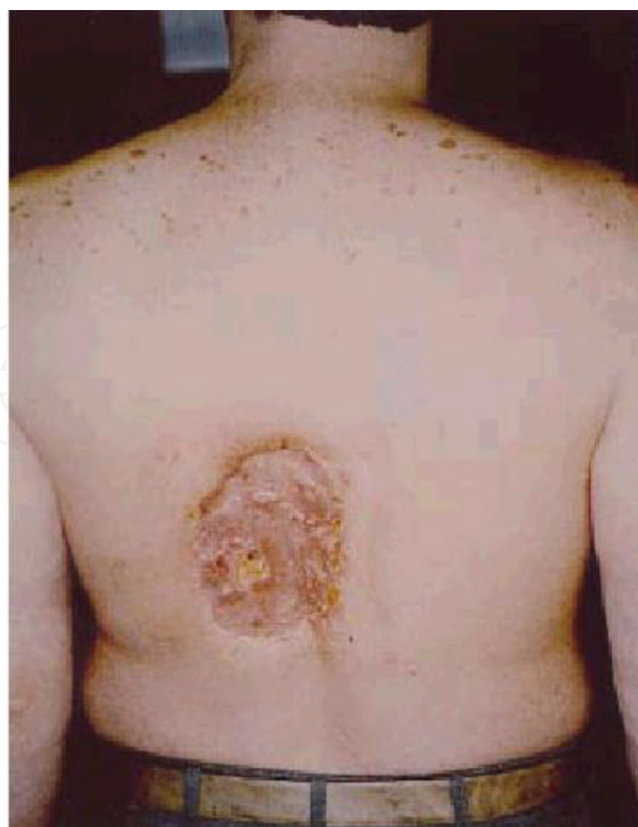
Figure 10. Radiation wound 22 months after angioplasty procedure [15].