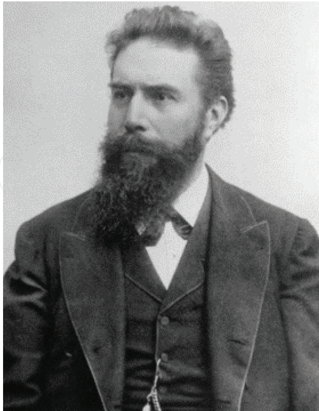
Figure 1. William Roentgen.