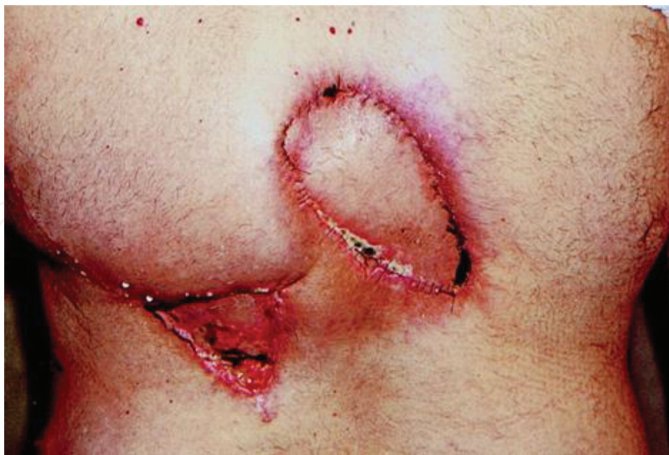
Figure 6. Tissue reaction effect for a 49-year-old patient who underwent two transjugular intrahepatic portosystemic shunt (TIPS) placements and one attempted TIPS placement within a week [12].