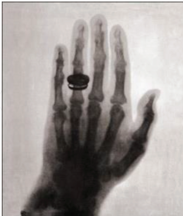
Figure 2. The first X-ray image (left hand of Bertha Roentgen).