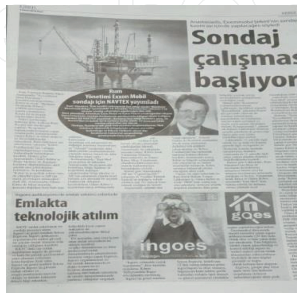
Figure 4. Newspaper.

Video 2 as 1. Ad [10], Video 3 as 2. Ad [11] and Video 4 as 3. Ad [12]