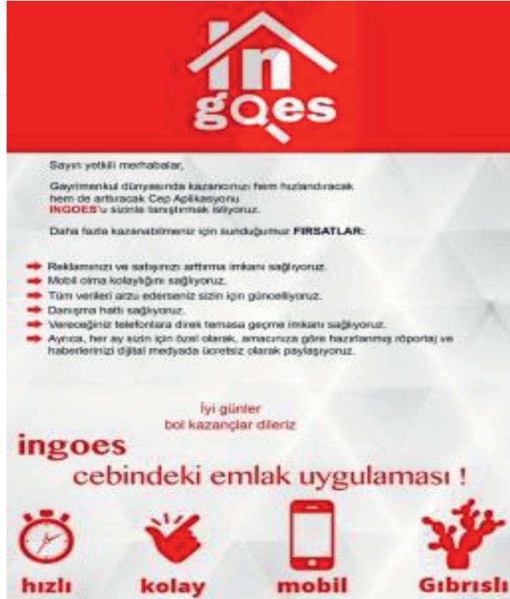
Figure 5. E-mail content.

Moreover, for 1-year membership, Ingoes provides free advertising space on Haber Kıbrıs and Vayguzzum ad spaces. Also, they give a space on Web TV-Property TV for 1-year membership agencies. First program was broadcasted with representatives initially from Özyalçın Construction Company and the next from Limasol GYO (Property Investment Partnership). Programs were broadcasted on Web TV as Property TV on December 28, 2018, and January 3, 2019, consecutively (Figure 6).