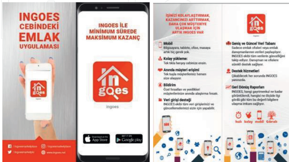
Figure 6. Ingoes flyer.