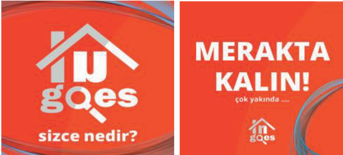
Figure 2. What is Ingoes?

On May 23, they asked the meaning of Ingoes through Redrofon street interviews.