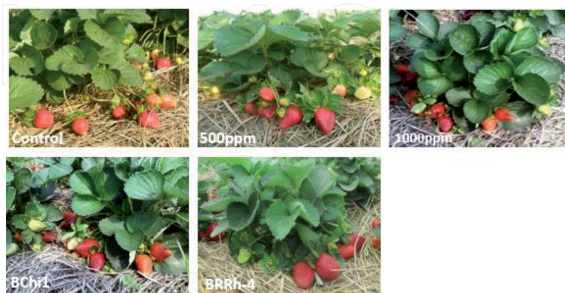
Figure 1. Effect of different doses of chitosan and probiotic bacteria on vegetative and reproductive growth of cv. Strawberry Festival. Adapted from [58, 73].

One of the interesting findings of this study is that both plant probiotic bacteria significantly improved growth and yield of strawberry almost at the same level with some minor differences although they belong to different bacterial genera. Probiotic bacterium, BRRh-4 provided the highest fruit yield increase (48%) in plants of “Strawberry Festival” compared to nontreated control ( Table 4 ). Treatments of strawberry plants with bacterial strains BRRh-4 and BChi1 consistently produced higher antioxidants, carotenoids, flavonoids, phenolics, and total anthocyanins compared to nontreated control [73]. A previous study showed that the members of the genus Phyllobacterium were good plant probiotics with the capacity of increasing fruit yield as well as quality [14]. Application of plant probiotic bacteria significantly increased total anthocyanin content in strawberry