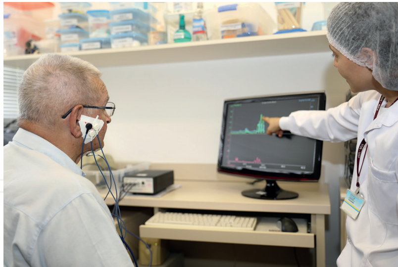
Figure 1. Patient and therapist during the direct training of swallowing, using the EMG biofeedback (4-channel neuroeducation equipment), monitoring the masseters, bilaterally, and suprahyoid muscles.