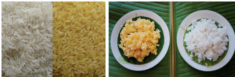
Figure 3. Polished white and Golden Rice and (a different cultivar, after 2 months of postharvest storage) after cooking.

Nevertheless, for Golden Rice ‘from a public health standpoint, for food fortification to be effective’, all the characteristics listed by Dr. Semba are satisfied, except when it comes to ‘undetectable by persons consuming it’. The Golden Rice colour is caused by the \beta -carotene content, a source of vitamin A for humans, which in Golden Rice is about 80–90% of all carotenoids [5]. It is the same \beta -carotene which colours mangos, papaya, squash and carrots, all of which consumers readily accept, and there is no taste associated with the \beta -carotene content. In Golden Rice, the intensity of the colour is proportional to the \beta -carotene content. The colour is obvious and cannot be ignored ( Figure 3 ).