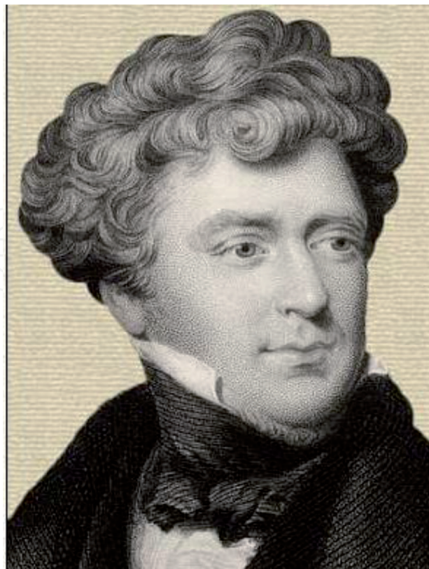
Dr. James Blundell

Because we know there are different blood groups today, doctors can save lives by transferring the right blood to patients. But previously, the blood transfusion was just a dream. This idea was first discussed by the doctors at the time of Renaissance. In later periods, a French doctor transfused calf blood to a patient in the 1600s and the patient died. Of course, blood transfusions which were made unaware of the presence of antigenic differences ended with death. Because of such unsuccessful trials, the blood transfusion gained a bad reputation. In 1817, Dr. James Blundell, an English obstetrician, said that living species had different blood structures, so blood could not be transfused between different species, but only human blood could be given to a human. In the following years, a total of 10 blood transfusions were performed, of which only 4 survived. Dr. Blundell did not know that human blood had different antigens, and people should be transfused with the same blood group antigens. And probably, this was the cause of death in some patients.