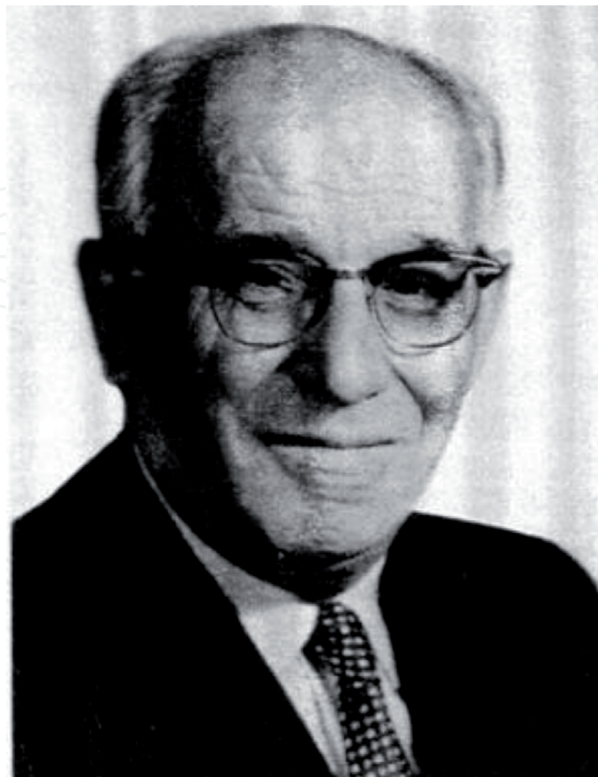
Dr. Philip Levine

In the mid-twentieth century, American researcher Philip Levine discovered Rhesus (Rh) factor and classified the blood as Rh (+) and Rh (-).