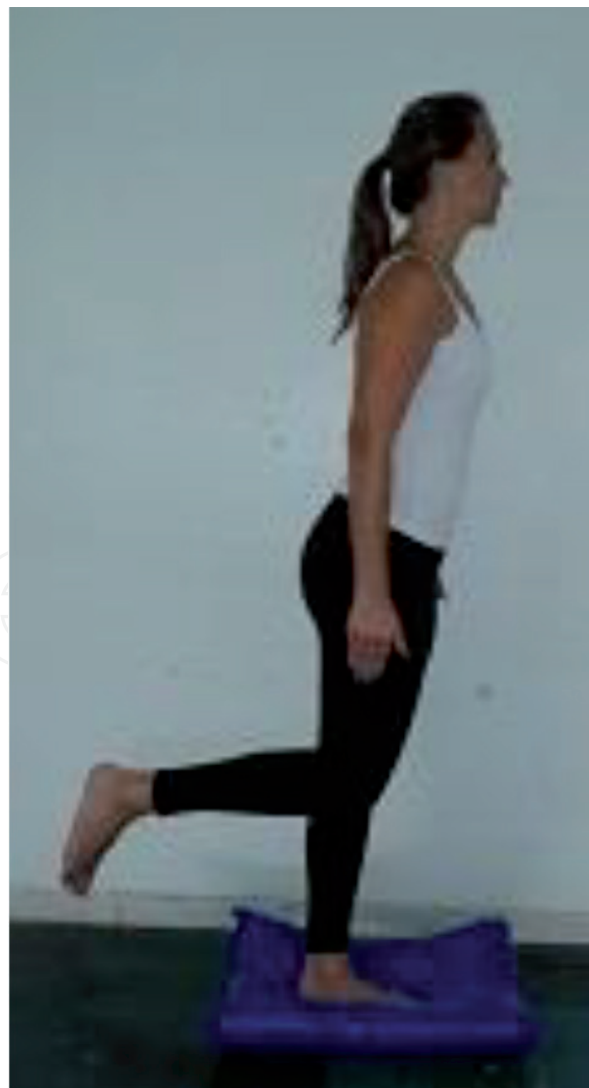
Figure 7. Exercise for simple body balance.