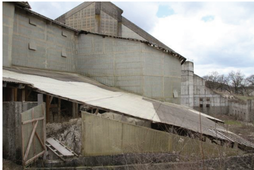
Figure 2. Provisional protection structure.