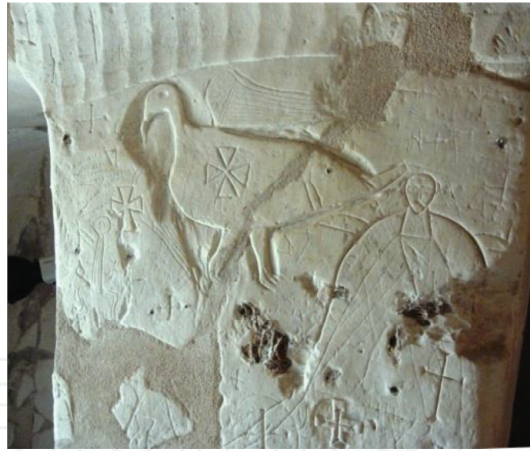
Figure 1. The interior of the churches and crosses, figures incised in the chalk wall.