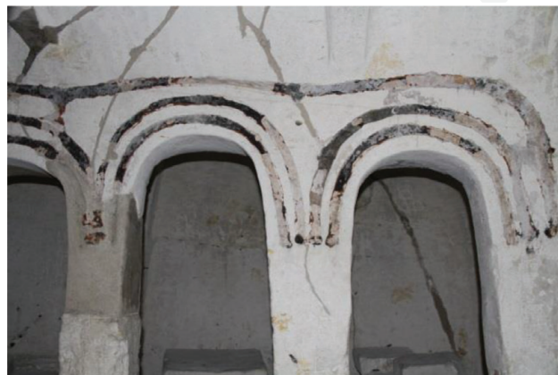
Figure 4. The photo of naos.

From the compositional point of view, the piece of chalk is a limestone, which is characterized as a biological clay, containing a multitude of limestone sediments, porous with small granularity and extremely fragile. The chalk sample has an organogenic chemical composition consisting of calcium vaterite and mineral clay, with a chemical formation comprising iron oxides and sediments. The wall is composed of calcium carbonate in a proportion of 90% and silicon dioxide [10]. In some places, there are traces of shells and shells of mollusks and ostracods, foraminifera, radiolar and diatomae, sponges of spongers and radiolarians, as well as crushed animal bones. Analysis of petrographic microscopy confirms that vaterite is generally unstable, except that it becomes stable below 10°C when the framboid is present inside the organic structure in the presence of CO 2 [11]. These framboid is in fact a conglomerate of smaller, especially spherical elements, having a dimension size varying between 36 and 150 nm [12, 13] ( Table 2 ).