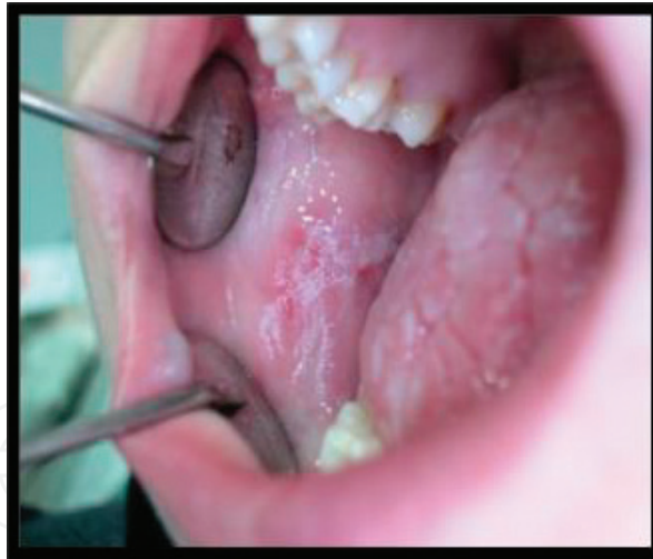
Figure 3. Chronic biting of the buccal mucosa with diffuse irregular lesions.