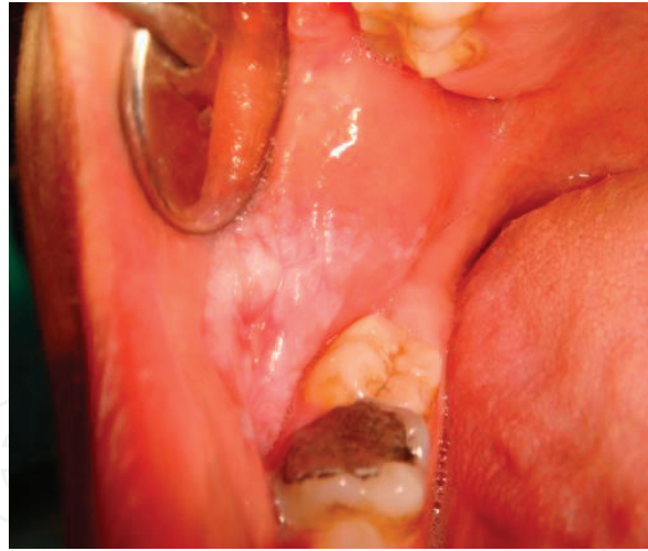
Figure 17. Contact allergic stomatitis due to amalgam.

contact stomatitis. For example, cinnamaldehyde or cinnamon essential oil, which are commonly used as flavoring agents in foods, beverages, candies, and hygiene products by contact with mucosal surfaces, may trigger the formation of allergic stomatitis [32].