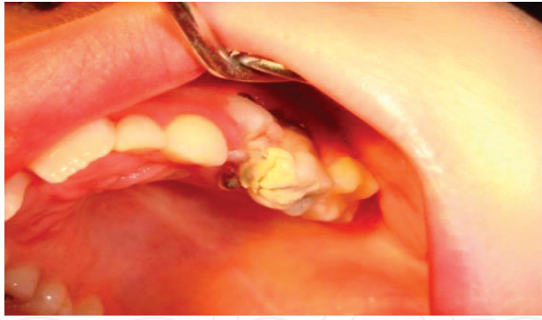
Figure 16. Acid/arsenic injury.

Etiology: Caustic chemical and drug materials when they come in contact with the oral mucosa are often very irritating and cause direct mucosal trauma. Inappropriate usage of medications, such as aspirin application onto the neighboring mucosa of painful teeth with decay, may result in mucosal trauma. Iatrogenically, during dental treatments irrigant solutions (sodium hypochlorite or formalin) or some endodontic pastes with arsenic can irritate the mucosa [2] ( Figure 16 ). However, such injuries are not very common since the introduction of rubber dam in dental practice.