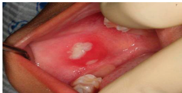
Figure 7. Traumatic ulcer after accidental mucosal biting.