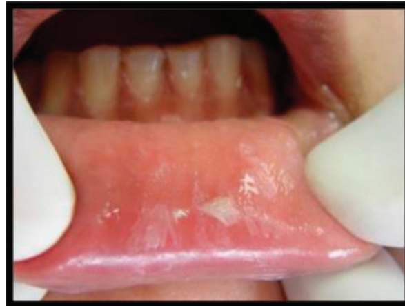
Figure 2. Diffuse irregular white area of lower lip due to chronic biting.

appear on the labial mucosa, and “morsicatio linguarum” if they occur on the lateral borders of the tongue [21]. The lesions are seen on the buccal mucosa, bilateral chewing line, labial mucosa, and lateral edges of the tongue.