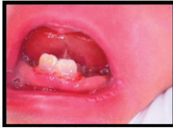
Figure 12. Traumatic ulcer caused by neonatal teeth.

etiological factors of traumatic ulcers could be mentioned traumas caused by bites, dental appliances, inappropriate tooth brushing, misfit of removable partial or total dentures, irritating caries edges, malocclusion and puncturing restorations [25].