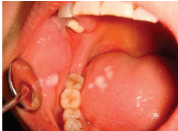
Figure 18. Thermal iatrogenic burn during aerator usage.

Treatment: No treatment is required for simple lesions. Care should be taken in deep lesions to avoid contamination during healing period. Saline would be prescribed to accelerate wound healing and avoid bacterial ingrowth. Ozone therapy and laser biomodulation could help for good prognosis. In severe damages, prophylactic antibiotic coverage is recommended. In hard tissue damages related to thermal burn, the necrotic area should be removed surgically in order to avoid damage to surrounding vital tissues and obtain blood supply for repair and subsequent regeneration.