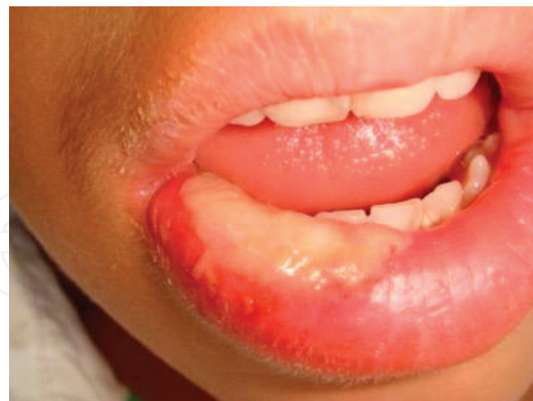
Figure 11. Lip biting after injection of local anesthetic solutions.

orthodontic treatment ( Figure 10 ), lip biting after injection of local anesthetic solutions ( Figure 11 ), neonatal teeth ( Figure 12 ), or faulty tooth brushing [1]. During dental treatments, iatrogenic damages can result in traumatic ulcer formation. Some medical treatments can cause oral ulcerations, such as brutal intubation for general anesthesia, ENT surgeries, or endoscopic interventions and iatrogenic malpractice applications. A high prevalence of traumatic ulcer of about 21.5% was reported among lower classes of Brazilian population [24]. Most prevalent types of lesions were reported to be traumatic ulcer and actinic cheilitis (7.5% for each) [25]. Among the