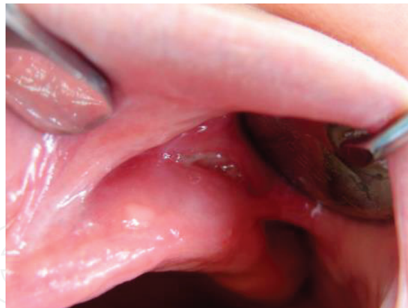
Figure 8. Traumatic ulcer caused by sharp edges of prosthesis.

and gingiva are related to different irritant factors such as hard foods and inappropriate hard brushing. Traumatic ulcer due to lip biting after inferior dental nerve block is seen on the lower lip. During orthodontic treatment, traumatic ulcers can occur especially on the buccal mucosa due to the irritation of braces or appliance wires.