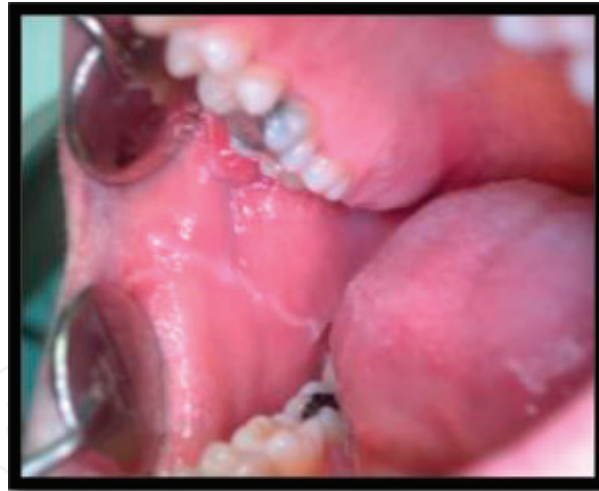
Figure 1. Linea alba seen on the buccal mucosa.