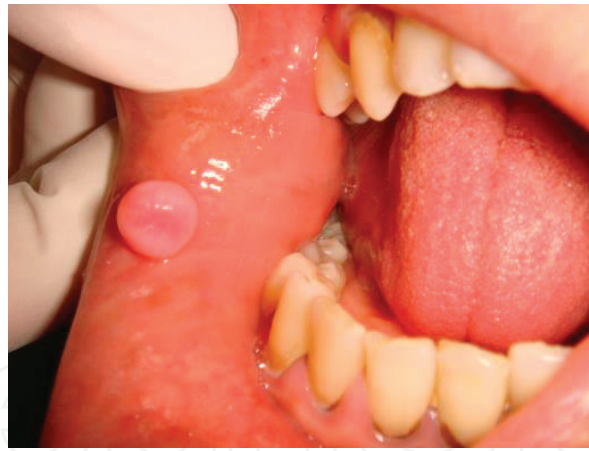
Figure 15. Traumatic fibroma of the buccal mucosa.

Clinical features: Lesions are shown as broad-based, with light color in respect to neighboring normal tissue, superficially whitish as the secondary trauma causes formation of hyperkeratotic ulcerative surface.