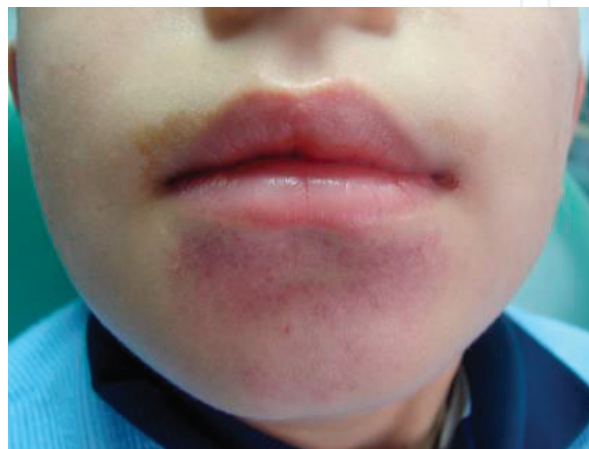
Figure 14. Lip-licking dermatitis due to sucking a ball all day.

Traumatic or irritation fibroma is a common benign exophytic and reactive oral lesion that develops secondary to injury.