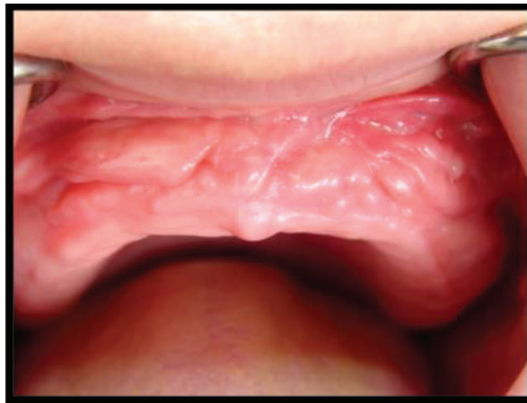
Figure 4. Epulis fissuratum.

Clinical features: Epulis fissuratum, reactive fibrous hyperplasia, or denture-induced fibrous hyperplasia is a relatively common hyperplasia of the fibrous connective tissue. Clinically, it presents as a raised sessile lesion in the form of folds with a smooth surface with normal or erythematous overlying mucosa. Because of chronic irritation, it may get traumatized and present with an ulcerated surface. It is considered as an overgrowth of intraoral tissues resulting from chronic irritation. This mucogingival hyperplasia is a reactive condition of oral mucosa to excessive mechanical pressure on mucosa ( Figure 4 ).