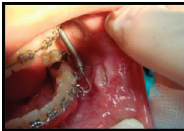
Figure 10. Traumatic ulcers during orthodontic treatment.