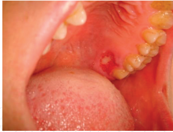
Figure 9. Traumatic ulcer caused by sharp or puncturing food stuff.