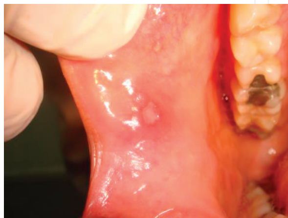
Figure 13. Recurrent aphthous stomatitis on the buccal mucosa.

Etiology: RAS is a complicated condition and the precise etiology still remains unknown. Several predisposing factors have been reported, such as trauma allergy, genetic predisposition, endocrine disturbances, emotional stress, and hematological deficiencies. Detailed examination of RAS history can explore the original etiology [27].